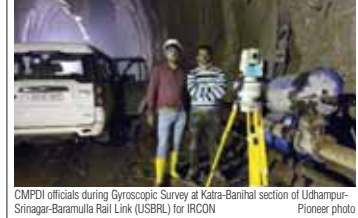
CMPDI officials during Gyroscopic Survey at Katra-Banihal section of Udhampur-Srinagar-Baramulla Rail Link (USBRL) for IRCON.

Ranchi: CMPDI has ventured into tunnel survey by successfully executing Gyroscopic Survey at Katra-Banihal section of Udhampur-Srinagar-Baramulla Rail Link (USBRL) for IRCON. This is a shift from traditional surveys in coal mines and adds a new dimension for CMPDI in the survey field. For the project, CMPDI used state the art DMT Make Gyromat 3000 survey equipment. Gyroscopic Survey for determination of Gyro azimuth at 18 faces in four tunnels in Katra-Banihal section of USBRL from 27.01.2021 to 02.02.2021.