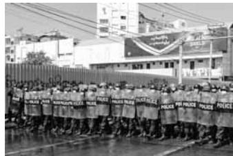
Police in riot gear march to take a position to block demonstrators at an intersection during a protest in Mandalay, Myanmar on Tuesday

Yangon: Police cracked down on demonstrators opposing Myanmar's military takeover, firing warning shots and shooting water cannons to disperse crowds that took to the streets again on Tuesday in defiance of rules making protests illegal.