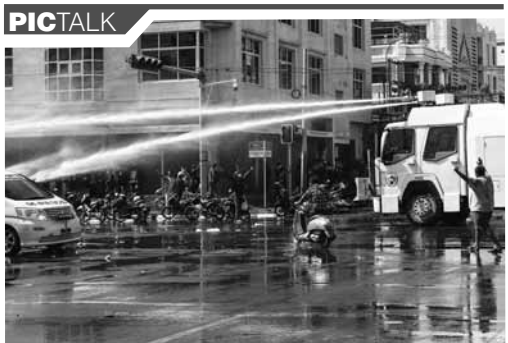
Police use water cannons to disperse protesters in Mandalay, Myanmar

But instead of Biden tweeting like Modi, the White House released an official statement detailing the interaction. The message it carries is that the days of "talk talk" on social media are now over with Trump's era and Indian policymakers should not expect Biden to behave and act in the manner his predecessor did. It also seems likely that the world will no longer witness the US President and the Indian Prime Minister seconding each other's statements and praising each other on Twitter. During the interaction, the two leaders resolved that the democratic process must be upheld in Myanmar. It simply implies that POTUS wants to see New Delhi playing a pivotal role in restoring the democratic regime in erstwhile Burma. The US well understands that Myanmar's junta may join hands with communist China for currying favour in the United Nations Security Council and, if that happens, the continuation of the military regime in Burma will only strengthen Beijing in the region. The growing influence of China, which pursues an expansionist policy both on land and in sea, will be against the interests of both New Delhi and Washington. As per the White House note, the "leaders agreed to stay in close touch on a range of global challenges"; however, we should not take it without a pinch of salt and this "closeness" would certainly be a bit different from what it was with Trump. Now India needs to make some smart moves as dealing with the American President looks like serious business.