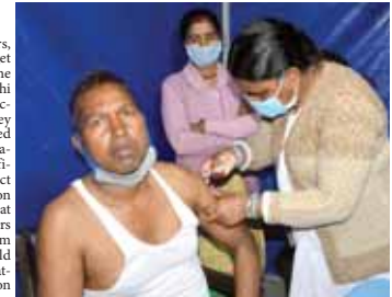
A medic inoculates the dose of Covishield vaccine to a frontline worker during a countrywide COVID-19 vaccination drive, at Police Line in Ranchi on Tuesday.

Ranchi has also reported the highest number of Adverse Events Following Immunization (AEFI) in Jharkhand. Of the 247 AEFI cases reported in the state so far, at least 169 were reported in Ranchi alone, highlights government data. Last week, a 52-year-old healthcare worker at a private hospital died 33 hours after vaccination here, triggering panic among beneficiaries registered to get free vaccine in the district,