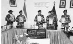
BSF Meru magazine is being published in electronic form. The further said that apart from being environment friendly it is economical too also from this year. This will be helpful to all personnel to get all the information of the organization.