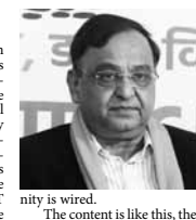
It is content is like this, the language is as if it has been decided that the man is the enjoyer and the woman is the enjoyer.

Pornography being served on the OTT platform, abuses of female dignity and non-consensual content are going to be curbed soon. The Central Government said on Tuesday that guidelines have been prepared in view of the complaints and suggestions received concerning the OTT platform and these will be implemented soon.