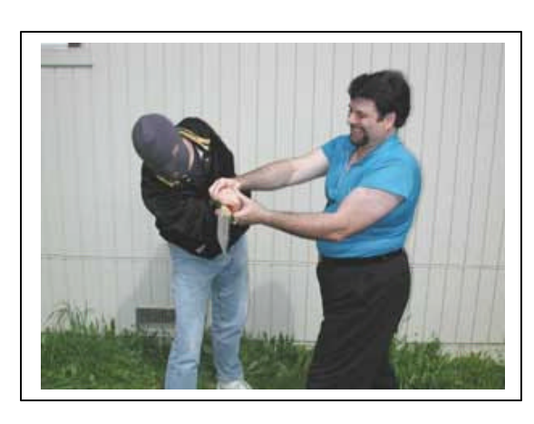
3 Using leverage, I reverse direction on his wrist and turn it to the outside.