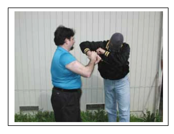
4 I plunge the knife into his heart.