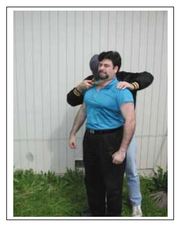
1 Terrorist grabs me from behind and hold's knife across my throat.