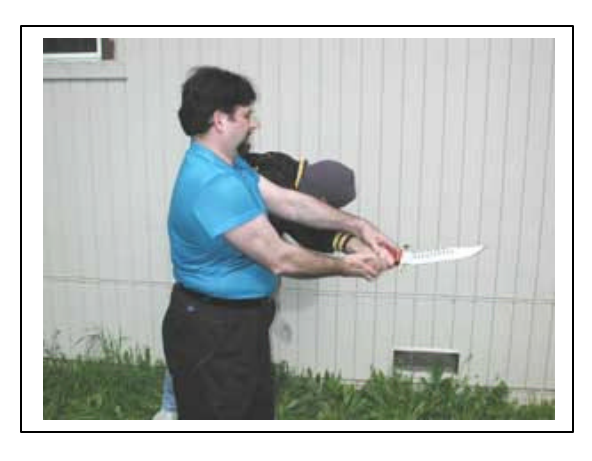
2 I turn to the side catching terrorist's wrist in both of my hands and continuing his forward motion.