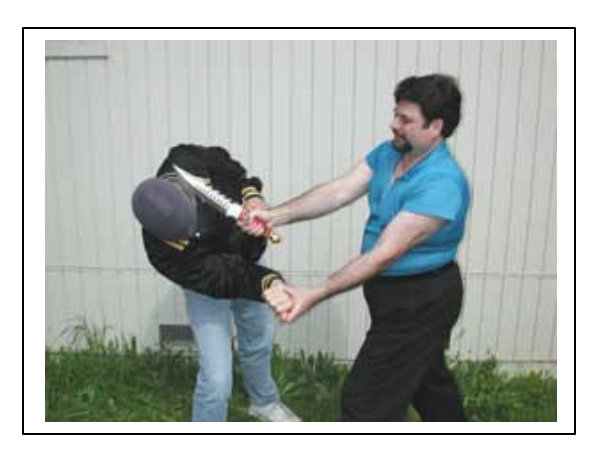
4 Continuing to turn his wrist with my left-hand, I take away the knife with my right-hand, and slash terrorist's carotid artery.