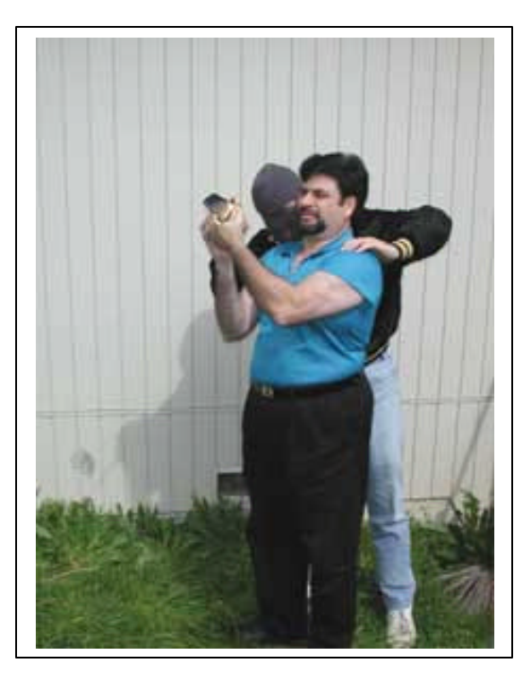
2 Using both hands, I twist his wrist downward and pull his knife-hand away from my throat.