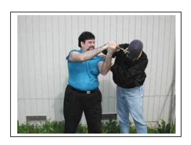
3 I turn under terrorist's knife-arm, and, continuing to turn his wrist down, redirect the knife toward him.