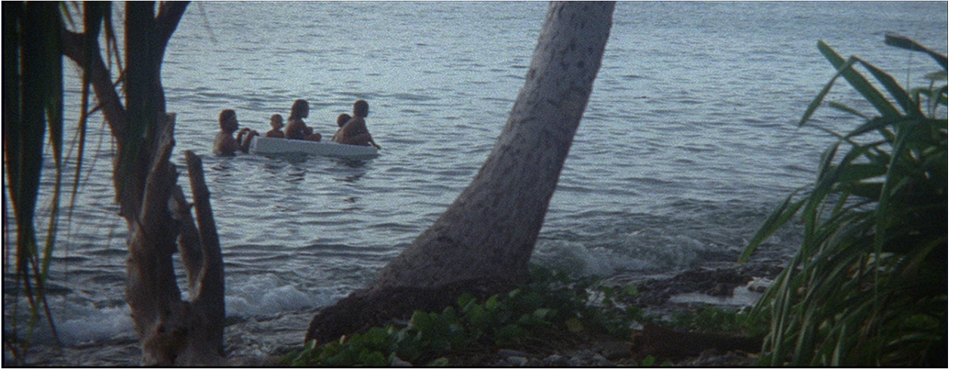
Ben Rivers, Slow Action , 2011.