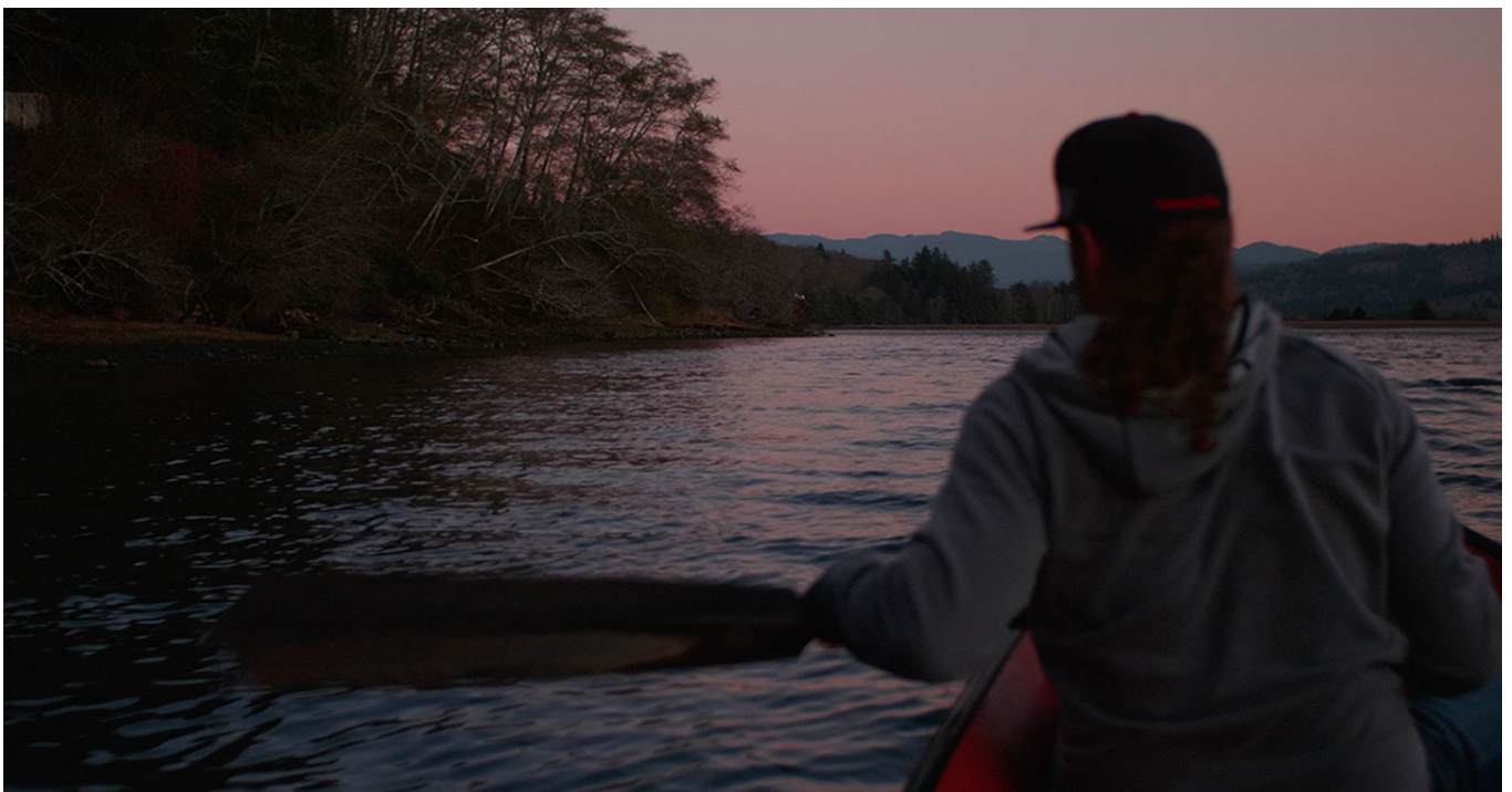
Sky Hopinka, matni: towards the ocean, towards the shore , 2020.