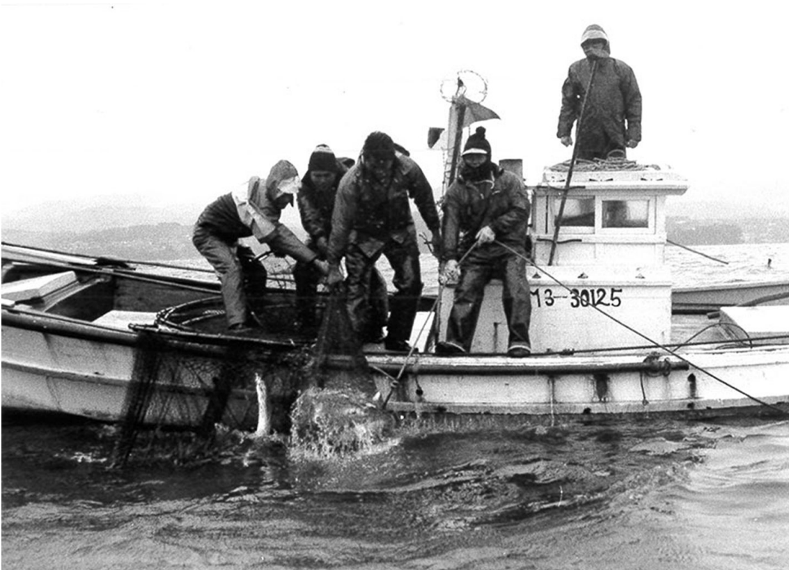
Tsuchimoto Noriaki, The Shiranui Sea , 1975.