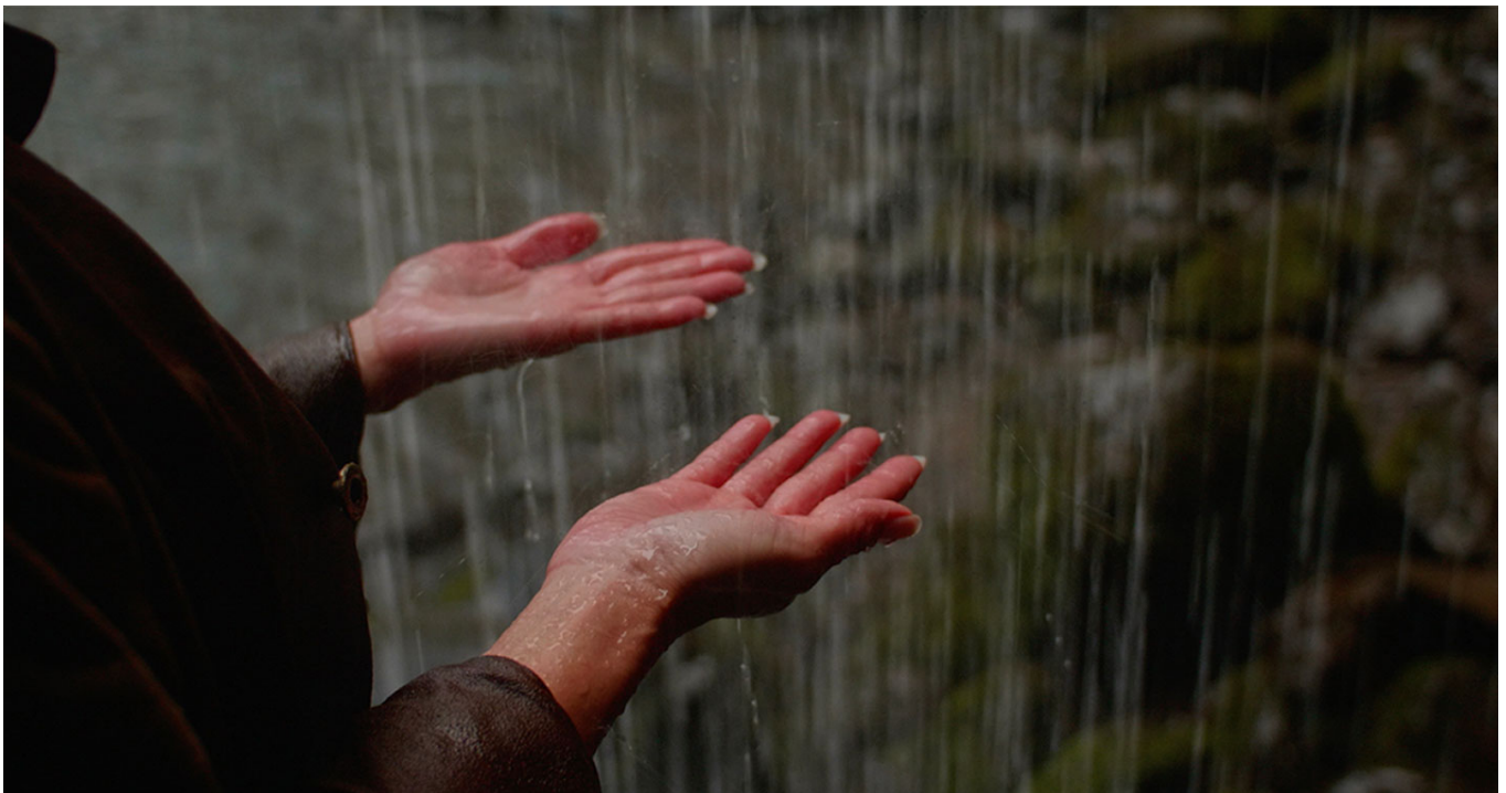
Sky Hopinka, matni: towards the ocean, towards the shore , 2020. Images courtesy of the artist.

Fundamental to “Shoreline Movements” is the conviction that the moving image possesses the capacity to gather people, in real and imagined ways, around an object of shared concern: reality itself. To care for reality is not to assert the goodness or adequacy of the world that exists; on the contrary, it is to see that the building of a new world is imperative. The common world is a future horizon, an ongoing project; as Hannah Arendt affirms, it must be