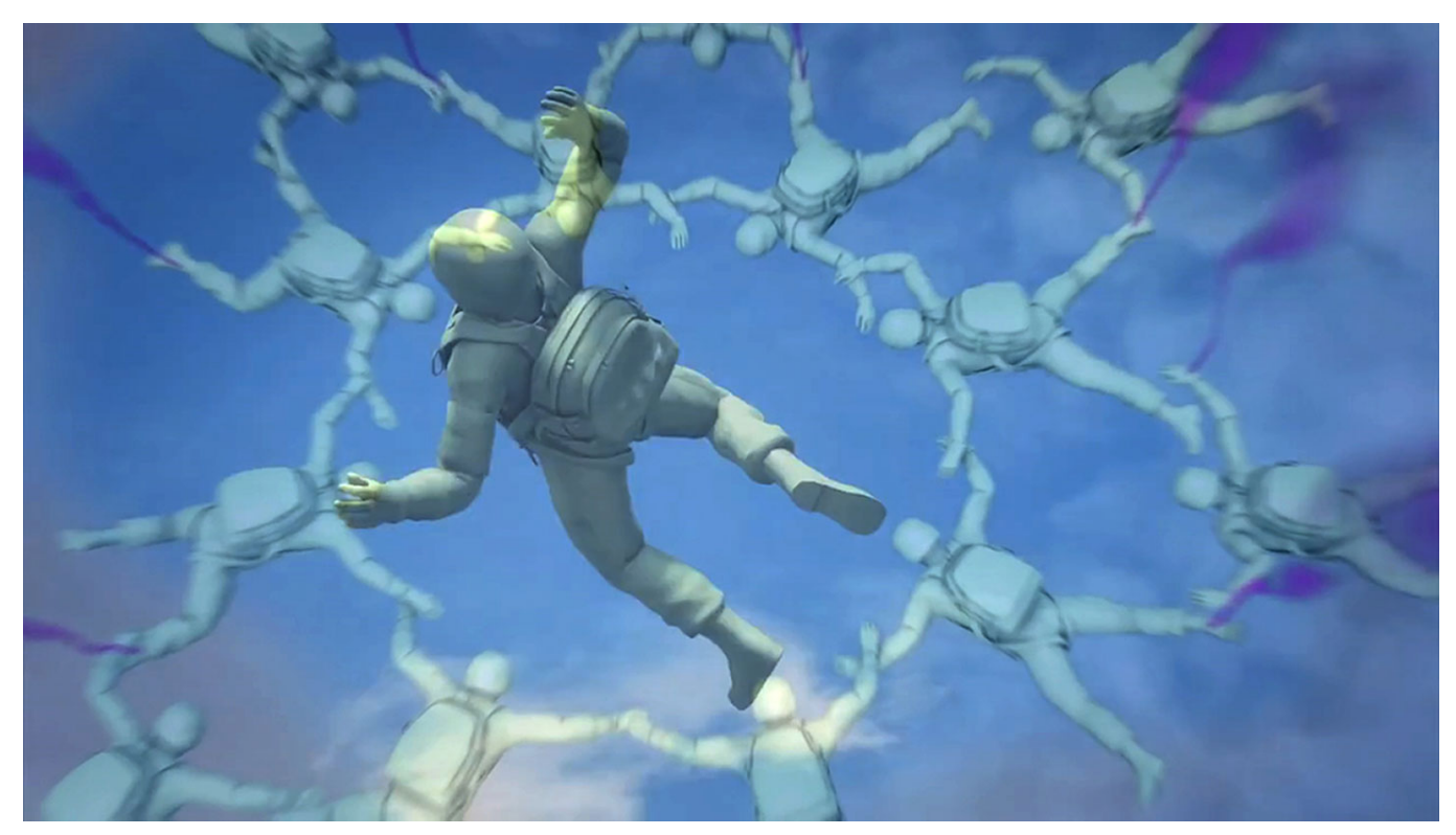
Peggy Ahwesh, The Blackest Sea, 2016.