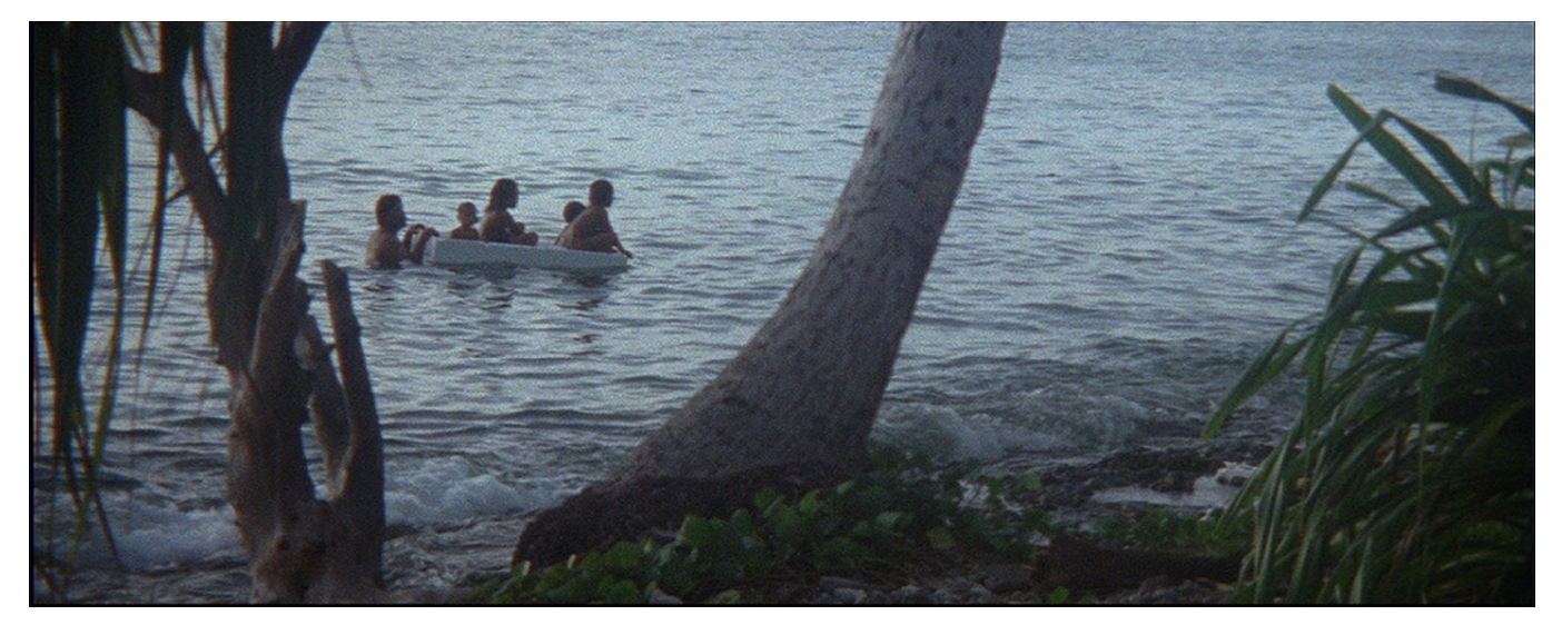
Ben Rivers, Slow Action, 2011.