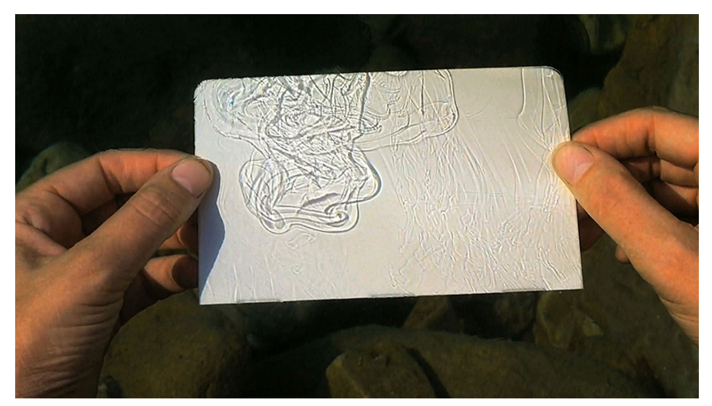
Edith Dekyndt, Dead Sea Drawings (Part 1), 2010.

The films of "Shoreline Movements" formulate strategies that oppose and, in some cases, explicitly interrogate the denial of the encounter proper to certain strains of the ethnographic tradition. Sitting on the beach with a small group of people who live on Orchid Island, just forty-five nautical miles from Taiwan, Hu Taili opens her film, Voices of Orchid Island (1993), with a question that immediately establishes her central concern with what it means to make an image of the other. She asks, "How do you feel about co-operating in this film?" To her query, one man responds that the more anthropologists engage with the island's indigenous Yami (Tao) community, the more harm they do. Ever aware of this danger, Hu's film is marked by its subtle