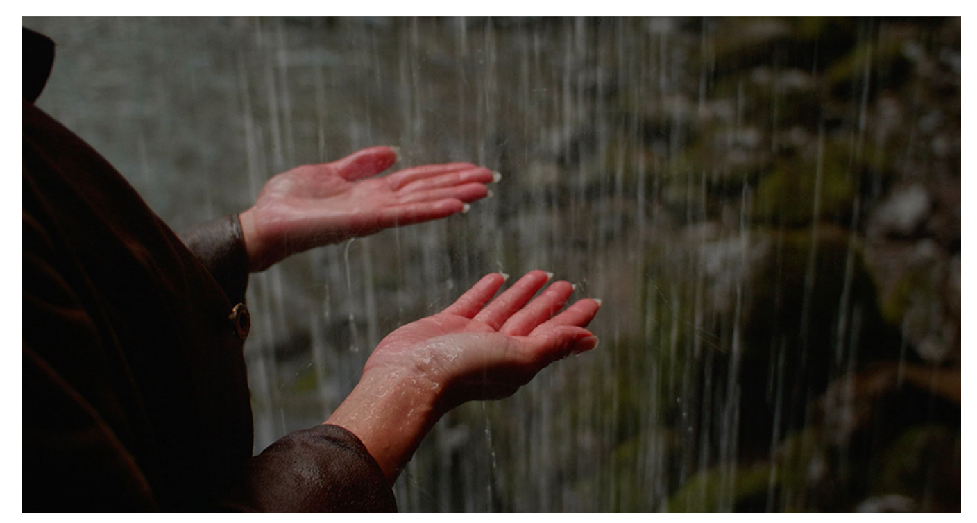
Sky Hopinka, małni: towards the ocean, towards the shore, 2020.

Fundamental to "Shoreline Movements" is the conviction that the moving image possesses the capacity to gather people, in real and imagined ways, around an object of shared concern: reality itself. To care for reality is not to assert the goodness or adequacy of the world that exists; on the contrary, it is to see that the building of a new world is imperative. The common world is a future horizon, an ongoing project; as Hannah Arendt affirms, it must be