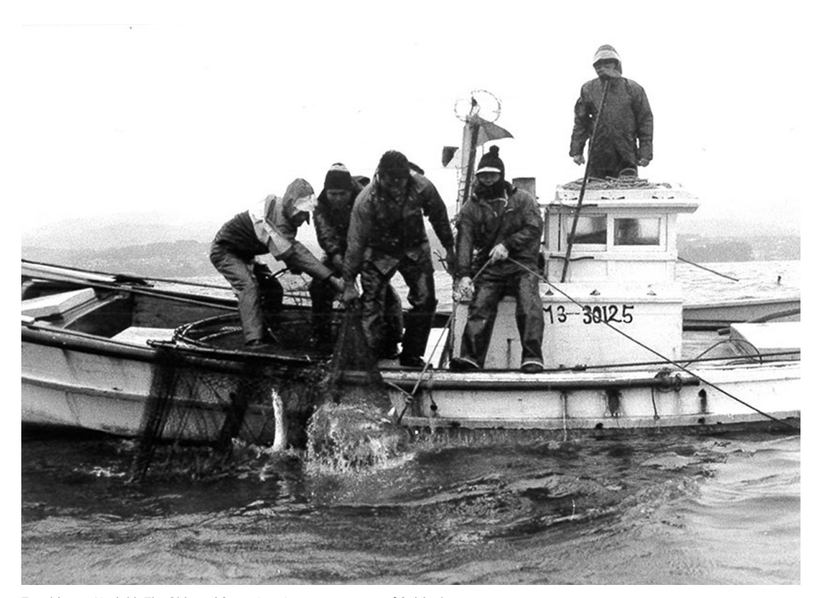
Tsuchimoto Noriaki, The Shiranui Sea, 1975.