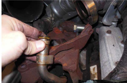
(Turbo mounting bolts)

Step 11: Loosen the intake manifold bolts on the driver's side. Completely remove the intake manifold bolts from the passenger side and note their location using a piece of cardboard. Remove the two bolts that go through the inner fan stator to the intake manifold (Located under the shroud).