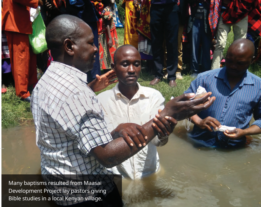
Many baptisms resulted from Maasai Development Project lay pastors giving Bible studies in a local Kenyan village.