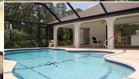
Images representative of available homes. No 2 homes are identical, but styles & amenities are similar.