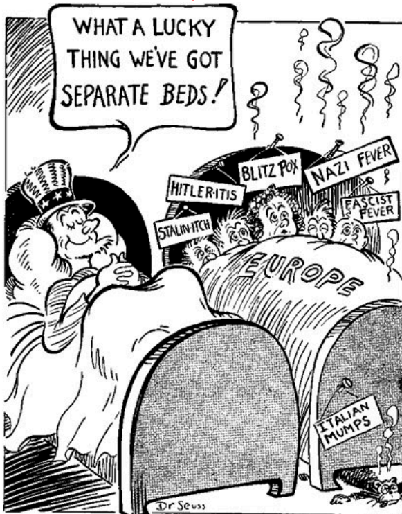
Ho Hum! No chance of contagion.