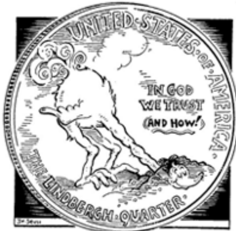
"Since when did we swap our ego for an ostrich?"