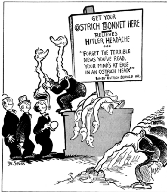
We Always Were Suckers for Ridiculous Hats . . .