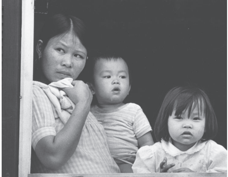
Generalist social workers use best practices with culturally diverse families.