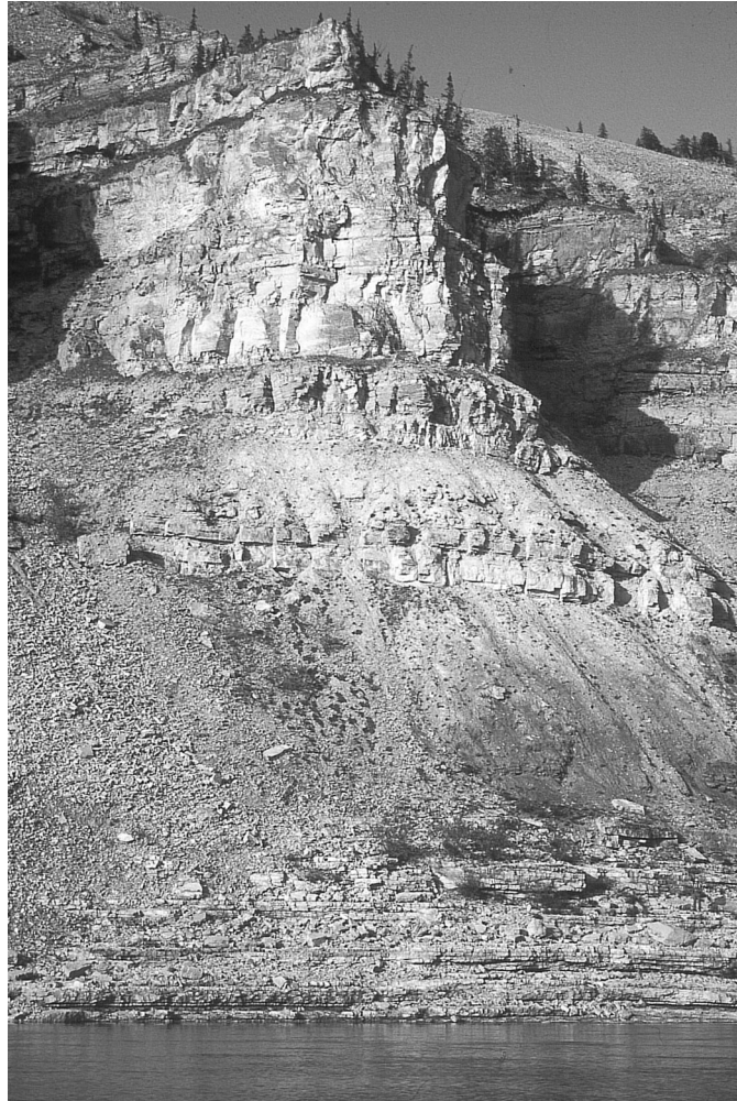
Figure 1.1. Fossiliferous cliffs along the Kotuikan River in Siberia. The distance from river level to the top of the cliff is more than 300 feet, recording some 20 million years of Early Cambrian history.

feet is precipitous, but Misha's attention is elsewhere, fixed on a layer of sedimentary rocks just above his head. To his experienced eye, the bed of crinkly laminated limestones tells of an ancient tidal flat that bordered a vanished ocean, a broad expanse of shoreline exposed at low tide, covered by thickly matted bacteria, and occasionally crossed by small animals. As I rest against the rock face, observing marginally