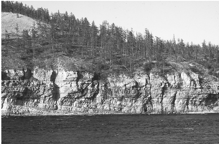
Figure 1.4. Upstream along the Kotuikan River, showing the angular unconformity between the latest Precambrian-Cambrian succession seen in figure 1.1 and an older package of sedimentary rocks that lies beneath it.

than, the whole interval from the Silurian age to the present day; and that during these vast, yet quite unknown periods of time, the world swarmed with living creatures.