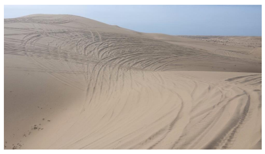
Figure 2-2. Imperial Sand Dunes Recreation Area

when traveling through the dunes, and the terrain is uniformly colored, making it difficult to judge vertical curvature and slope angles. Also, there are many seemingly randomly distributed razor-back dunes that have a gradual, easily climbable slope on one side and a hazardous, steep drop-off on the other side. Some of the drop-offs are 30 feet deep. These drop-offs may not be visible to an approaching driver until the ROV is only a few feet away. Another hazard when riding on the dunes is the possibility of colliding with other off-highway vehicles. Nearly all vehicles observed had tall flags attached to enhance their visibility. These are required for ROVs at this location. ROVs observed on the dunes generally, but not always, traveled slowly in areas with limited sight distance.