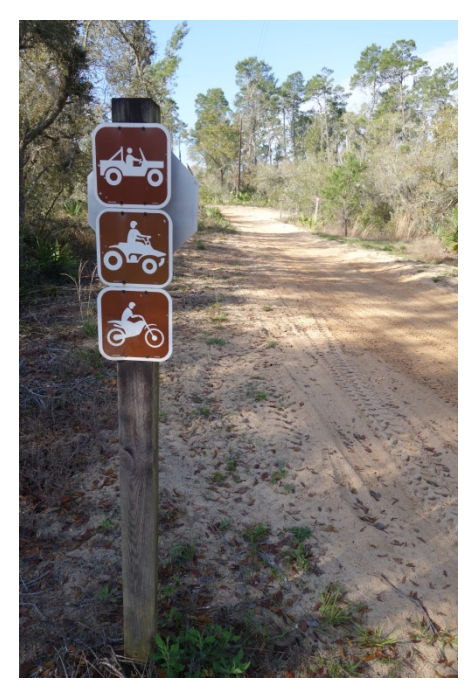
Figure 2-3. Mixed-Use Trail for Off-Highway Vehicles, Ocala National Forest