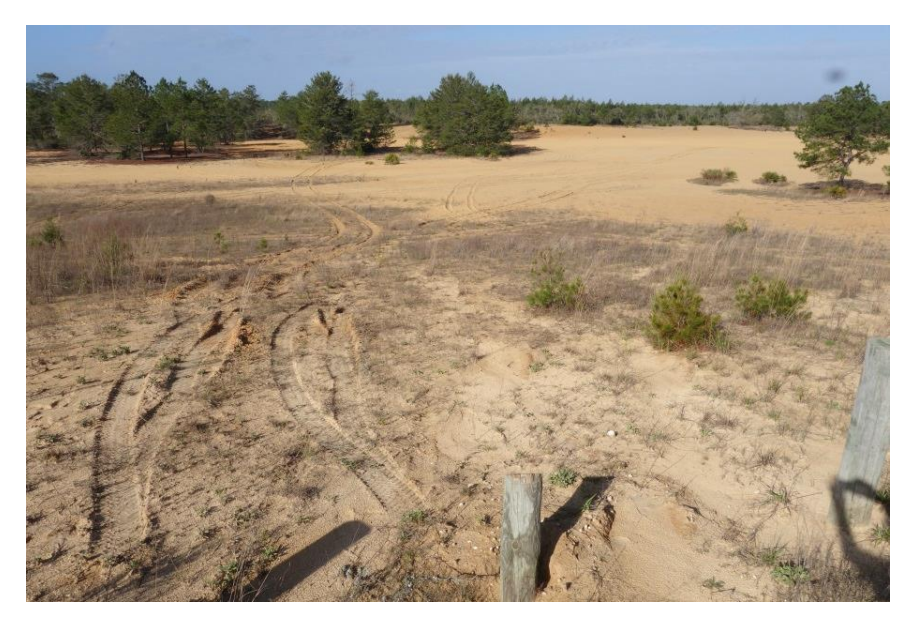
Figure 2-4. Open Section of Trail, Ocala National Forest