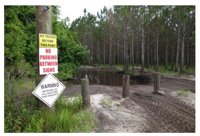
Figure 2-5. Trail Entrance at Private Off-Highway Vehicle Park