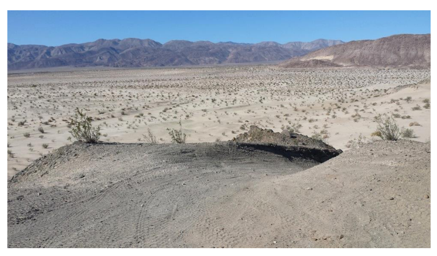
Figure 2-1. View of Ocotillo Wells State Vehicular Recreation Area

Ocotillo Wells State Vehicular Recreation Area (SVRA) is a desert riding area about 2 hours east of San Diego. Observations were conducted throughout the south and central sections of this area off of California State Route 78, but no observations were made in the "Badlands" region in the northern section of the SVRA. The areas observed have a variety of groomed, hard packed, and sandy roads. Major trails through this area vary in width, but may be as much as 50 feet wide. They are mostly flat and level, with miles between points of interest. On the major trails some ROVs traveled at estimated speeds of 40 mph or more. Other trails require greater technical skills to navigate washes and ravines, and they also require keen attention to spot other drivers who may be approaching from other directions. There are some dune areas, small mesas and hills, and some trails that are much like ski moguls in character. In general, the major trails afford relatively long stretches of high-speed travel with good sight distance, leading to more technical riding near hills and other geological features with more limited sight distance due to curves and hills on the trails. Figure 2-1 provides a typical view of the surrounding terrain from the top of a hill.