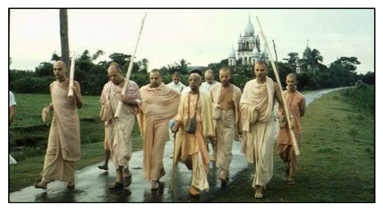
"We put for your judgment to understand. [...] That is our request." (Lecture, Seattle, Oct. 7, 1968)