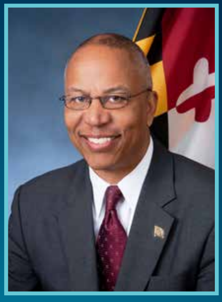
BOYD K. RUTHERFORD Lt. Governor