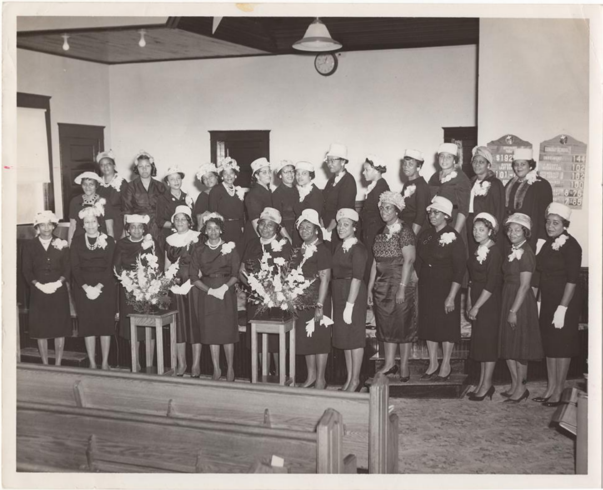
Women of Antioch Missionary Baptist Church, circa 1950s [IDs?]