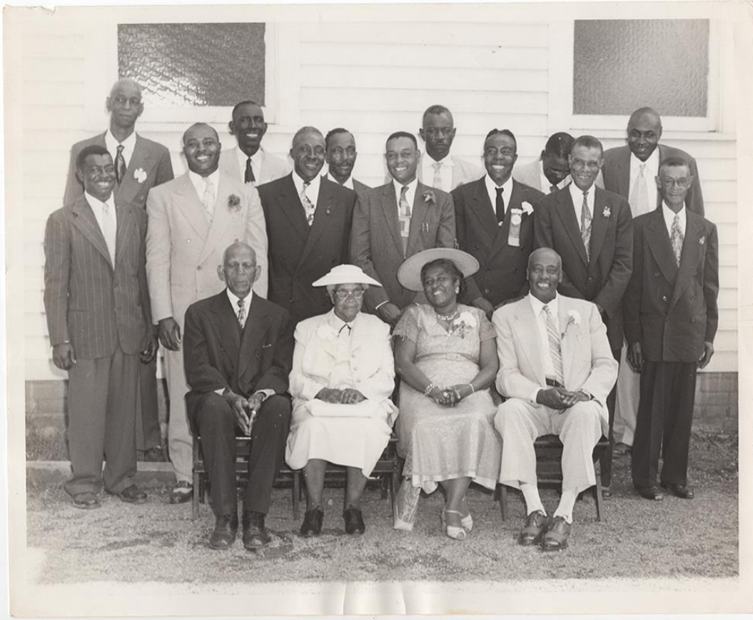
Antioch Missionary Baptist Church members, circa 1940s.