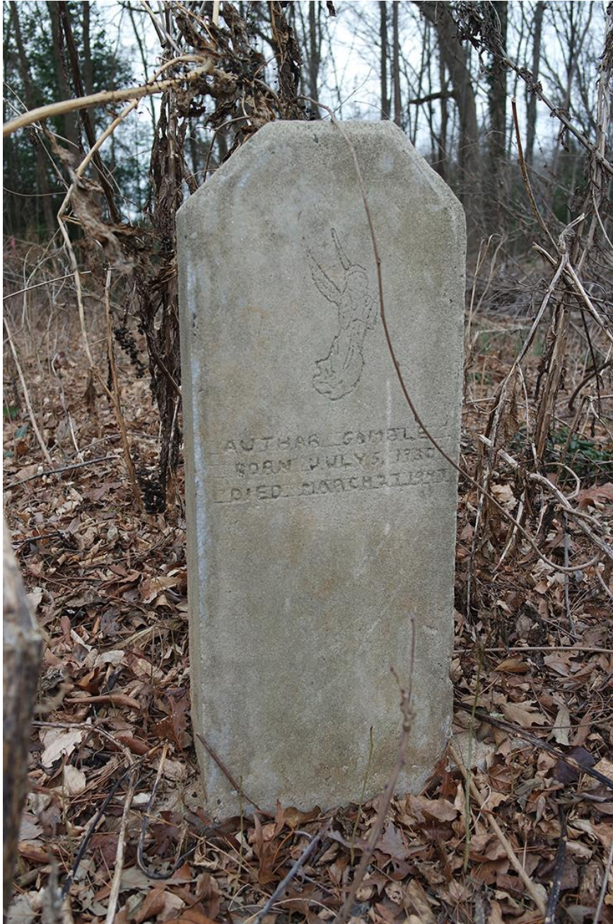
Authar Gamble grave marker