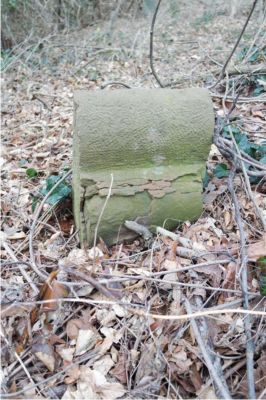
Uninscribed sandstone marker