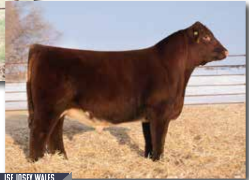
JSF JOSEY WALES

This is easily the best set of Durham Blues we have ever offered on Durham Nation. Take your pick based on personal preference, pedigree, or calving date and have a front pasture female for years to come.