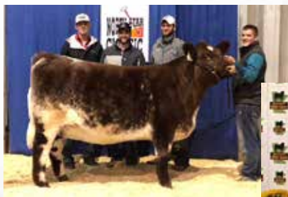
One of the winningest Shorthorn heifers in the upper Midwest in 2017. Owned by Josh Vachal, Pearl Valley Shorthorns, sired by Outlaw.