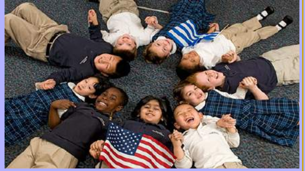
Paving the Way for a great education for our children.

The deadline for the Paving the Way to Our Future campaign is April 1 st – Thank You the many families, staff and friends of OCS that have contributed. Know that ALL of the funds raised goes directly back to OCS!