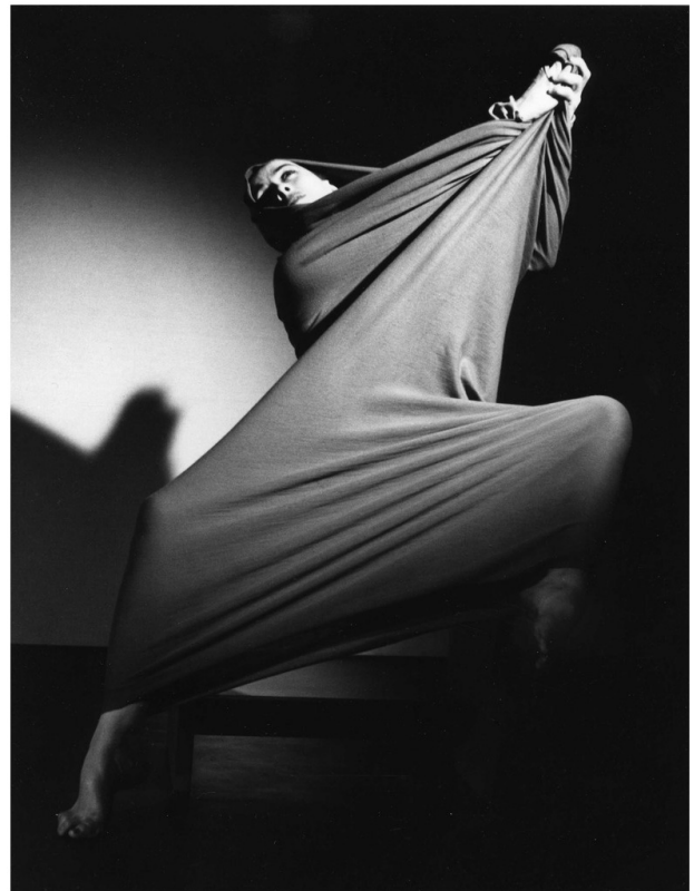
Barbara Morgan (American, 1900–1992), Portrait of Martha Graham in “Lamentation” . Gelatin-silver print, 1935

The stylized figure of a dancer with her arm thrown over her head and her skirt pulled between her legs was inspired by the great 20th-century choreographer and dancer Martha Graham (1894–1991), who also was one of his clients.