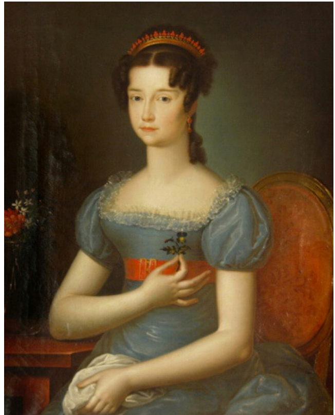
Luigi Bernero (Italy, 1775–1848), Maria Teresa di Savoia . Oil on canvas, about 1817. Palazzo Reale, Turin, Italy

Most coral in Europe came from the sea around Naples and nearby Torre del Greco. In the 19th century coral jewelry became a fashionable souvenir. This was partly because people could travel more once the Napoleonic wars had ended in 1815, but also due to the growing popularity of naturalistic jewelry in the 1850s.