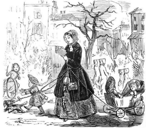
"How to Make a Chatelaine a Real Blessing to a Mother" in Punch or the London Charivari , 1849. Contemporary newspapers poked fun at the excessive size and often eccentric choice of pendant implements.

A very fashionable accessory in the first half of the 19th-century, a chatelaine is a decorative belt hook or clasp with suspended chains mounted with useful household implements. This example, the grandest and most complete by Froment-Meurice in existence today, was only known from drawings until the Museum acquired it in 2007. The clasp and seal bear the joint arms of the French Belbeuf