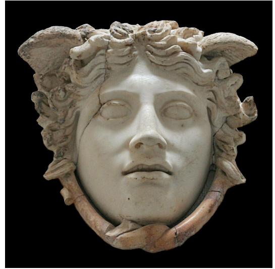
Medusa Rondanini , Marble, Roman copy after Greek 5th-century BCE original by Phidias. Glyptothek, Munich

The brooch is set with the head of Medusa after the ancient Greek marble head, the Medusa Rondanini (440 bce),