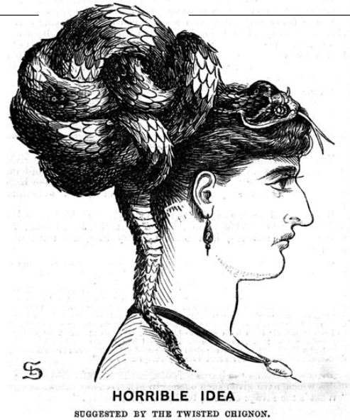
Punch or the London Charivari , January 11, 1868.

While design drawings were commonly used for made-to-order jewelry, important commissions often required a model. This necklace was a maquette (a scale model), created to be approved for a special commission from a French princess. Although glass stands in for the diamonds, emeralds, and rubies, the famed French jeweler Boucheron used gold and silver for the structure. The necklace contrasts sharply with the more typically sentimental use of snakes in jewelry of the Victorian period. The motif of the serpent swallowing its tail, most fashionable in the 1840s, symbolizes eternity and often represented a token of love. Queen Victoria wore a serpent bracelet to her first council meeting in 1837 and was given a serpent and emerald engagement ring by Prince Albert.