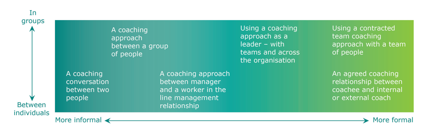
Diagram A: Range of uses of coaching

A coaching approach can be used in different ways ranging from informal to more formal as shown in diagram A. It can take place between two people or in groups of people.