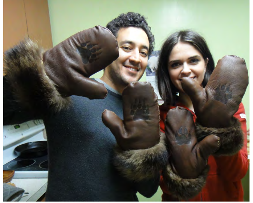
Illustration 2: Happy mitt-shop participants from Sudbury, ON

Making mittens yourself gives you an opportunity to customize and personalize them to your heart's content. This can be elaborate ornamentation, including bead work, burning and the like, or simple elegance. The skills learned in making these mittens will give you the knowledge and confidence to repair them and other equipment in the field. And of course, this is an opportunity to connect with the heritage of our land and those that have travelled it before us.