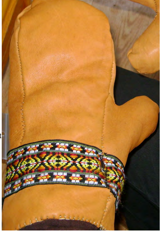
Illustration 12: One outer mitten done with decorative ribbon attached.