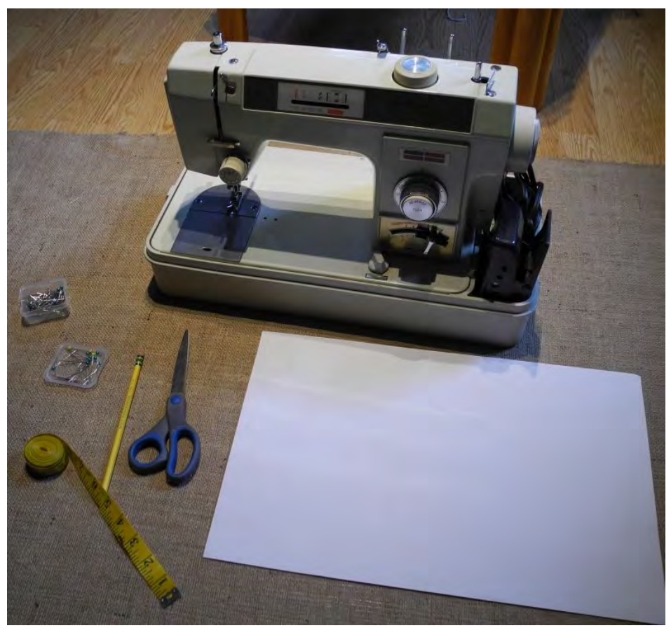
Illustration 4: You need only supply a few standard household items.