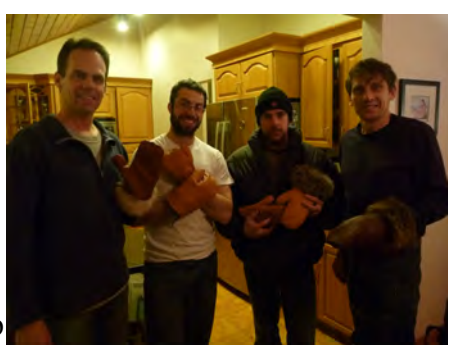
Illustration 1: Winter Mittens workshop in Sudbury, ON.

in the right direction. Tried, tested and true, these mitts have travelled with us for over a thousand kilometres in Northern frozen made during a Lure of the North landscapes. All the materials are entirely breathable, which keeps your hands dry even on the hardest days of work.