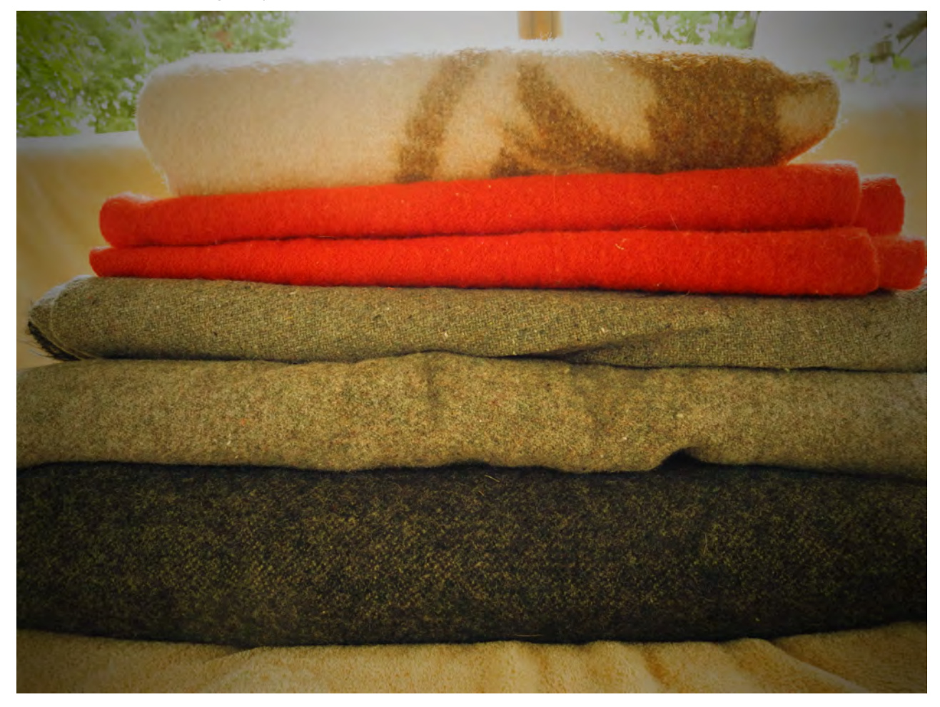
Illustration 5: Blankets Galore!~ Have a wool blanket that you don't mind chopping up? Use your own instead!

Things to consider when using your own blanket: