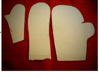
Illustration 6: Pattern pieces used for both inner and outer mittens. See appendix for larger images.

We use the same size for the outer as the inner because the buckskin will stretch out and the wool layer will not. So the outer may seem like it is a tight fit as first but wear them for a couple of days and they will become the perfect fit!