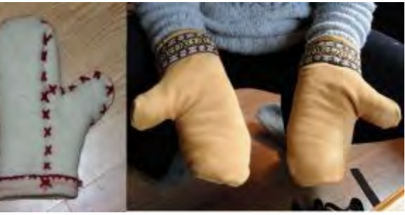
Illustration 15: Les Deux!!