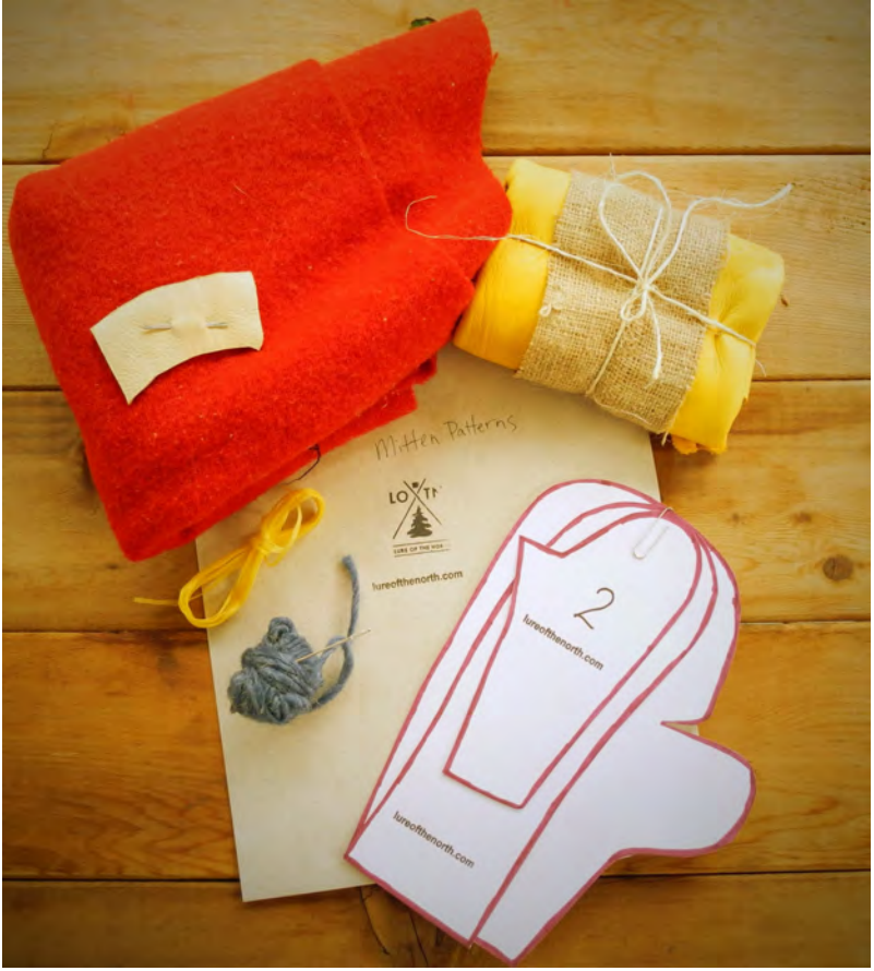
Illustration 3: Everything included in "Mitten Making Kit". Note: there are a variety of deerskin colours and decorative ribbons available.

Winter Mitten Making Kits from Lure of the North come in two different styles: Double Layer Wool Mitt Kit; and Single Layer Wool Mitt Kit. A full kit will include all of the items listed below: