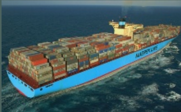
EMMA MÆRSK is ONE of the largest containerships in the world.

Moving goods by sea is the most energy efficient and environmentally friendly way to transport cargo. In fact, driving 15 km from your house to the electronics store will produce more CO 2 than it took to transport a flat screen TV produced half-way across the world to the store.