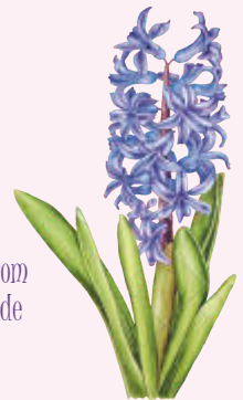
Flowers from Countryside Florist

I would like to make a monetary donation of $ _____