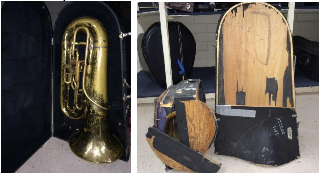
Sorry state of a tuba and tuba case

Thank you in advance for your assistance.