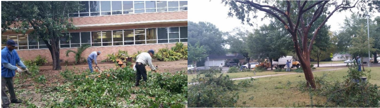
Tree trimming and removal from the JMS front entrance done November 6 th