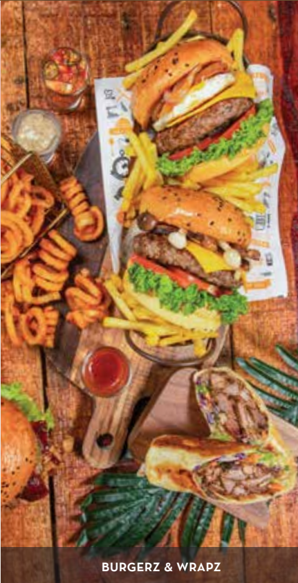
BURGERZ & WRAPZ