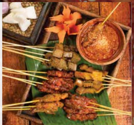
CHARCOAL GRILLED SATAY