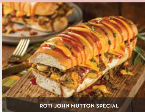
ROTI JOHN MUTTON SPECIAL