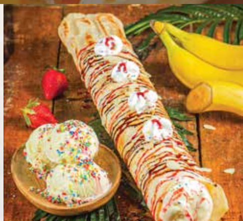
BANANA ICE CREAM TISSUE

SPECIALTY PRATA, MURTABAK & DESSERT PRATA WILL BE AVAILABLE FROM 4PM ONWARDS.