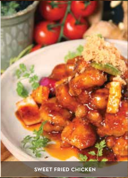
SWEET FRIED CHICKEN