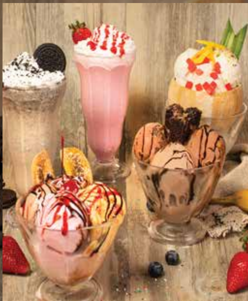
MILKSHAKES & SUNDAES