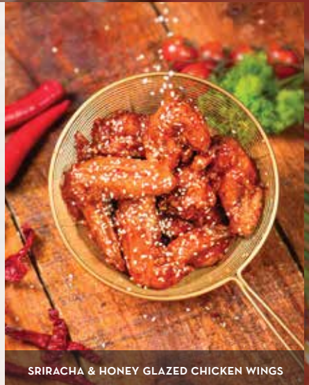
SRIRACHA & HONEY GLAZED CHICKEN WINGS