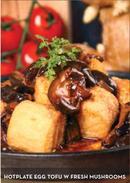
HOTPLATE EGG TOFU W FRESH MUSHROOMS