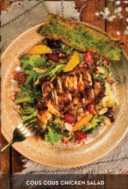
COUS COUS CHICKEN SALAD