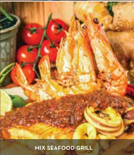
MIX SEAFOOD GRILL