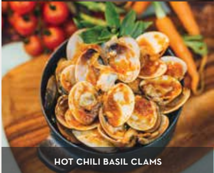
HOT CHILI BASIL CLAMS