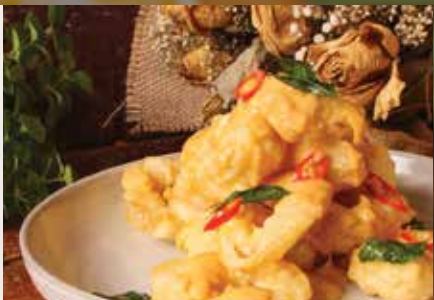
CRISPY SQUID & SALTED EGG