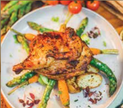
ROASTED CHICKEN POULET