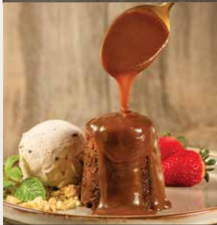
STICKY DATE PUDDING