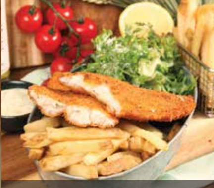
CLASSIC FISH & CHIPS