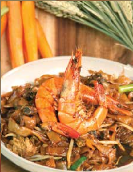
PENANG CHAR KWAY TEOW