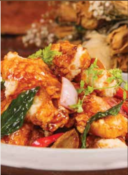
KAM HEONG & CURRY LEAVES SLICED FISH