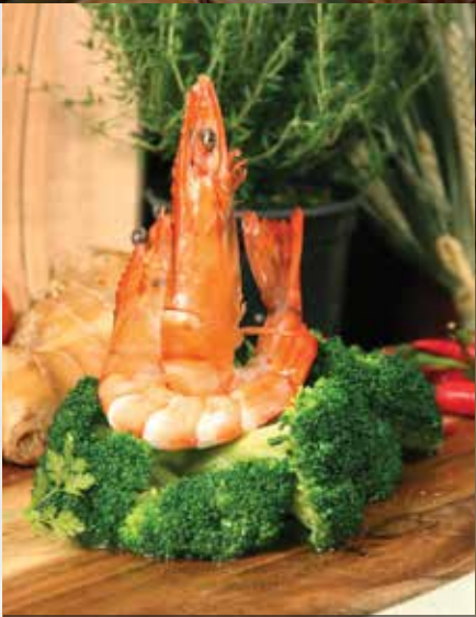
STIR FRIED BROCCOLI W TIGER PRAWNS