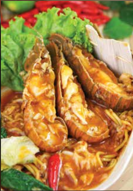
CHILI CRAYFISH MEE