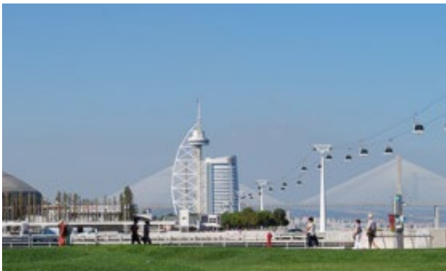
Parque Das Nacoes