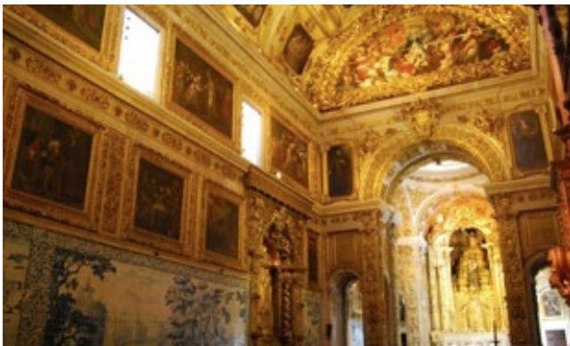
Madre De Deus Convent