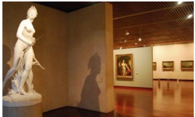
Calouste Gulbenkian Museum