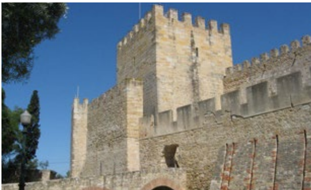
St. George's Castle