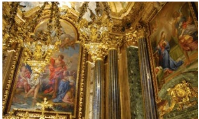
The World's Most Expensive Chapel