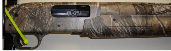
Mossberg Model 500 Ported Barrel Full Camo Pump Action 3 inch $349.46