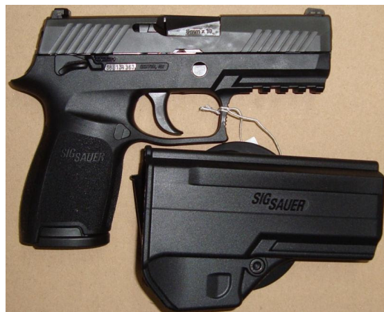
Sig Sauer P320 9mm $606.59