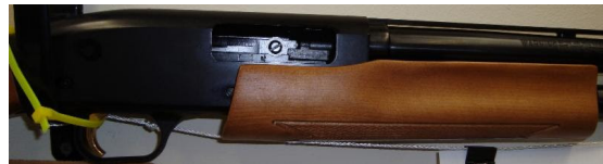
Mossberg Model 500 Wood Stock Pump 3 inch $314.40