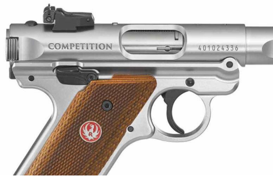
Ruger Mark IV Competition 620.00

Sunday October 21st 8am- 4pm - An opportunity for the ladies to learn