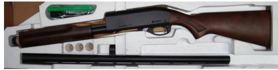
Remington Express 870 3 inch $390.00