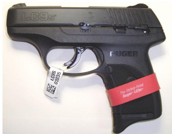
Ruger LC9 Compact 9mm $397.38