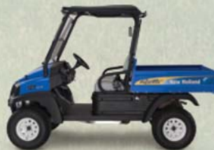
125 • 2 Passenger