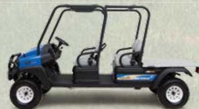
125 • 4 Passenger