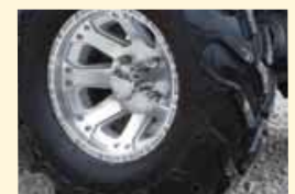
Mud tire with aluminum alloy rim