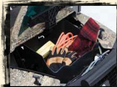
Under-hood Storage Box (125 model only)