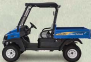
120 • 2 Passenger