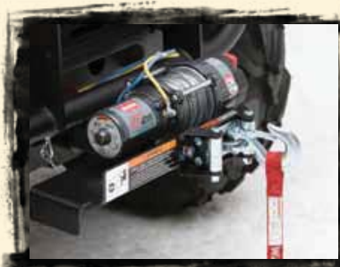
Warn Winch Kit, 2500 lbs.