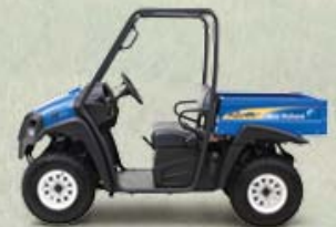
115 • 2 Passenger

*Some vehicles shown with optional equipment.