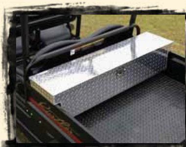
Cargo Bed Toolbox