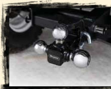
Triple Ball Pintle Hitch