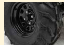
Mud tire with black rim