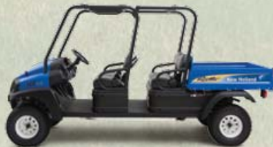
120 • 4 Passenger