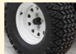
All Terrain with white rim