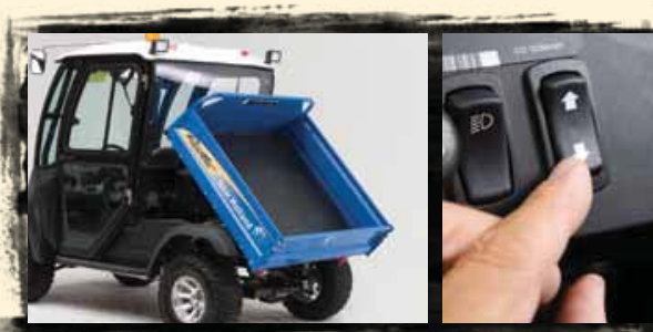
Electric Bed Lift (shown with Bed Mat)