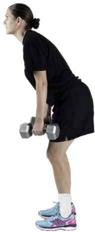
Bent-over Row Starting position