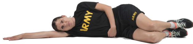
Count two & Count four

There is no modification for this exercise.