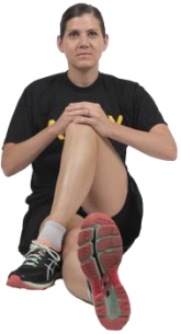
Stretch position 1