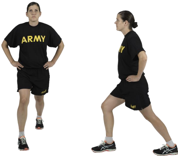
Stretch position 1