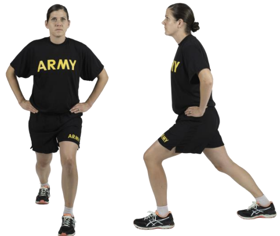
Stretch position 2