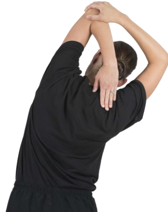
Stretch position 2

Modify by reducing lean of the upper body.