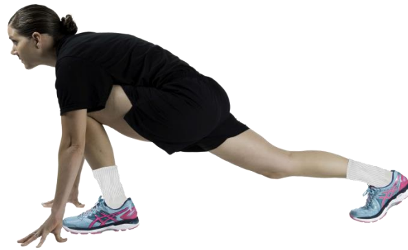
Count four – step back with right leg

Modify by stepping back and forth with alternating legs, rather than gliding quickly.