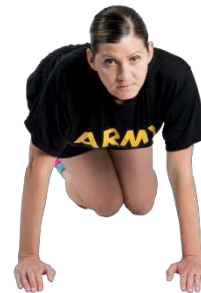
Stretch position 2

Alternate stretch is either the Hip and Back Stretch or the Hand and Knees Buttocks Stretch.