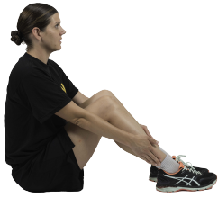
Curl Down Starting position