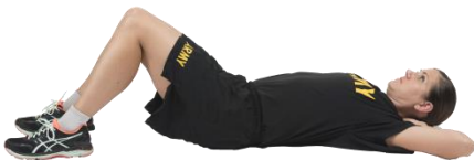
Curl Up Starting position