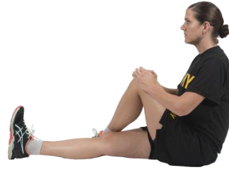
Stretch position 2