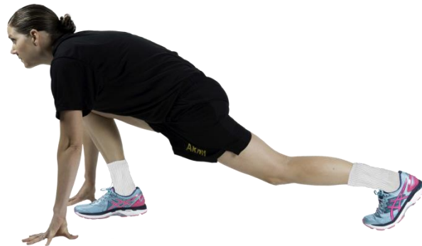
Count two – step back with left leg