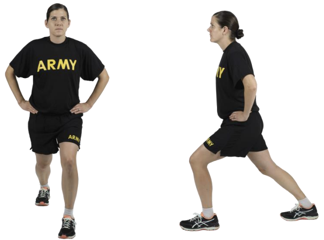
Stretch position 2