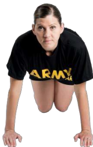
Hands and Knees Buttocks Stretch Starting position