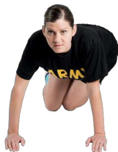
Stretch position 1