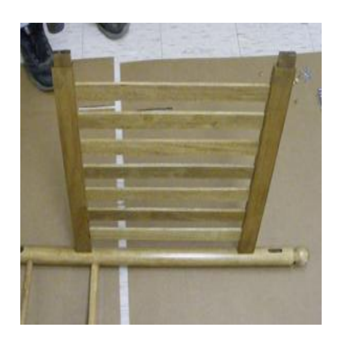
Fig. 1 Fig. 2

Pick up Chair Back A and insert in the mortises in the . Chair side D-R. Note: leave top mortise open for Headrest F in a later step. Fig. 2