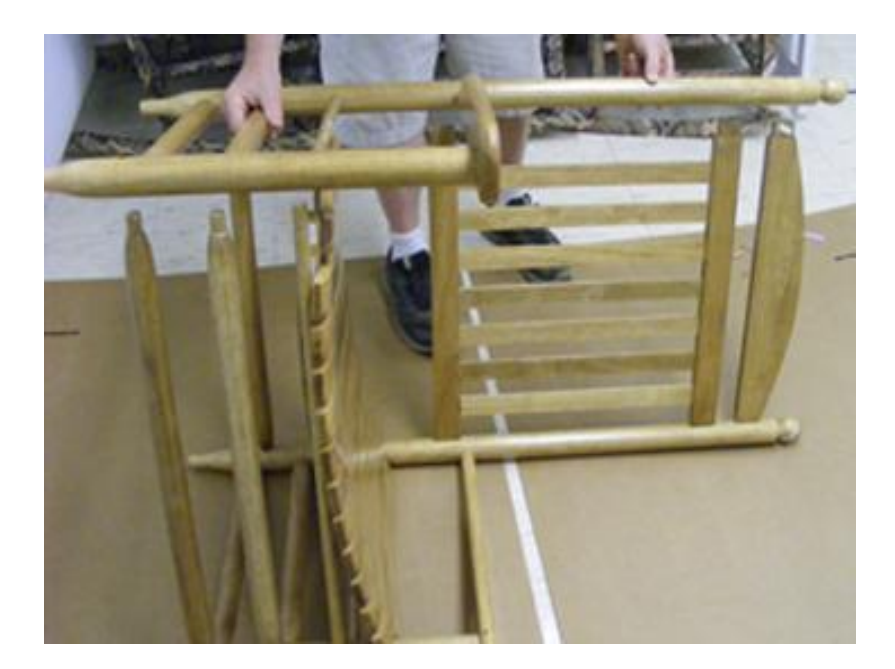
Fig. 5 Fig. 6