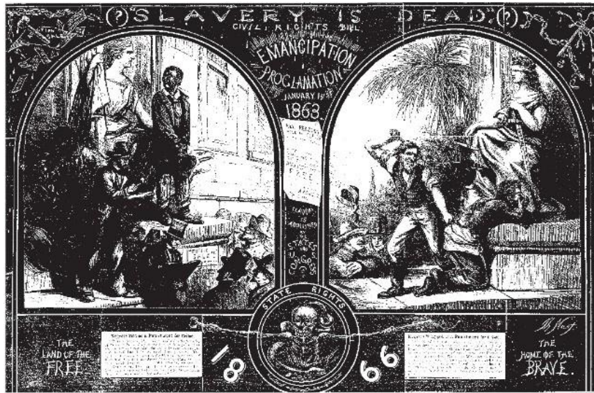
Source: Thomas Nast, "Slavery is Dead(?)" Harper's Weekly , 1867. Library of Congress

Question 4 is based on the following cartoon.