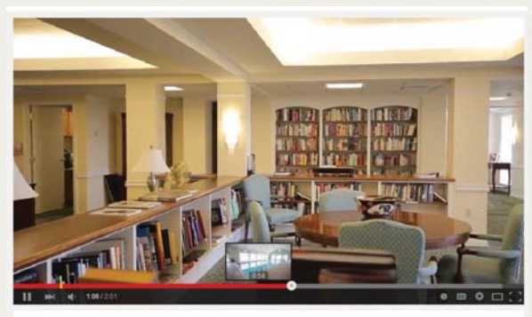
Kendal at Lexington - Amenities