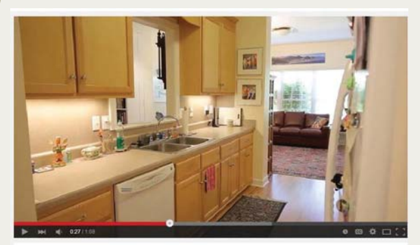
■ Kendal at Lexington - Town Home Cottage

This cottage is a single level, town home style end unit with access to a covered walkway to the main building. It features two full baths, hardwood floors, a designer kitchen open to the dining room or sitting area and a gas fireplace all in sixteen hundred square feet plus the extra space in 2 enclosed patios.