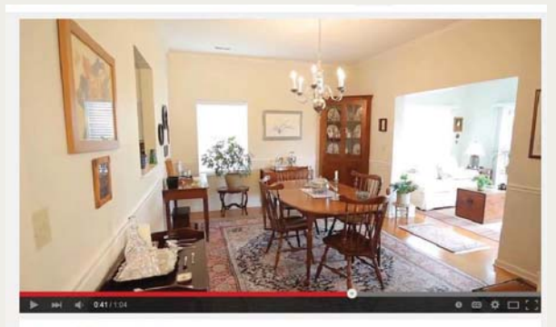
Kendal at Lexington - Cottage

2000 Sq.Ft Stand-Alone Cottage (Floor Plan U)