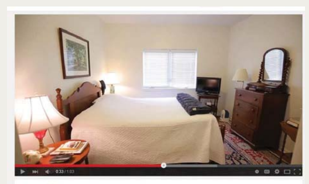
Kendal at Lexington - Apartment

This apartment is just under nine hundred square feet. It features one bedroom, a den, one full bathroom, hardwood floors, upgraded kitchen plus an extra enclosed patio with direct access to the outdoors and easy access to all community amenity spaces.