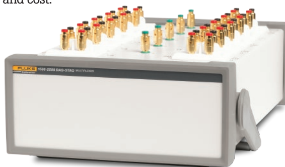
1586-2588 DAQ-STAQ Multiplexer

Universal input channels accepts 2-, 3-, or 4-wire connections to measure temperature, resistance, dc voltage, and dc current for data acquisition applications on the factory floor where channel count and scan speed are important.