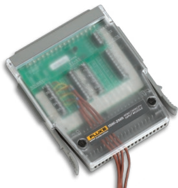
1586-2586 High-Capacity Module

For a calibration lab where accuracy is of primary importance, the Super-DAQ is best configured with a DAQ-STAQ Multiplexer. The external DAQ-STAQ features mini-jack thermocouple terminals—each with its own reference junction sensor—and patented mini-DWF, gold-plated input terminals, which accept bare wire, spade lug, or mini-banana-plug probe terminations. Easily connect and disconnect PRTs, thermistors, and thermocouples for benchtop temperature calibration. It can be stacked on the 1586A to reduce footprint in busy labs. Having the flexibility to configure the Super-DAQ for factory or lab use reduces your equipment needs and cost.