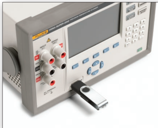
Easily transfer Super-DAQ data and setup files using a USB flash drive.

The Super-DAQ also includes two levels of data security to prevent unauthorized users from tampering with or forging test data or setup files. This security feature is especially important to industries that are regulated by government agencies where data traceability is required.