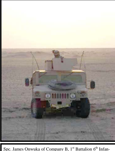
try Regiment watches over his shoulder as he guides his Humvee backwards before the Task Force Regulars Squad Live Fire Exercise.