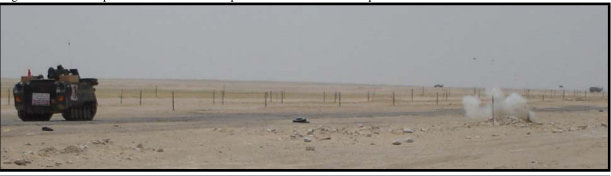
Third Squad, First Platoon, Company C, 40<sup>th</sup> Engineer Battalion, Task Force Conqueror, has a simulated Improvised Explosive Device (IED) explode during the route clearance lane of Sapper Stakes.

IED training is one of the major focuses of the military. The Army continually strives to improve IED detection training and the implementation of this new device is a big step forward.