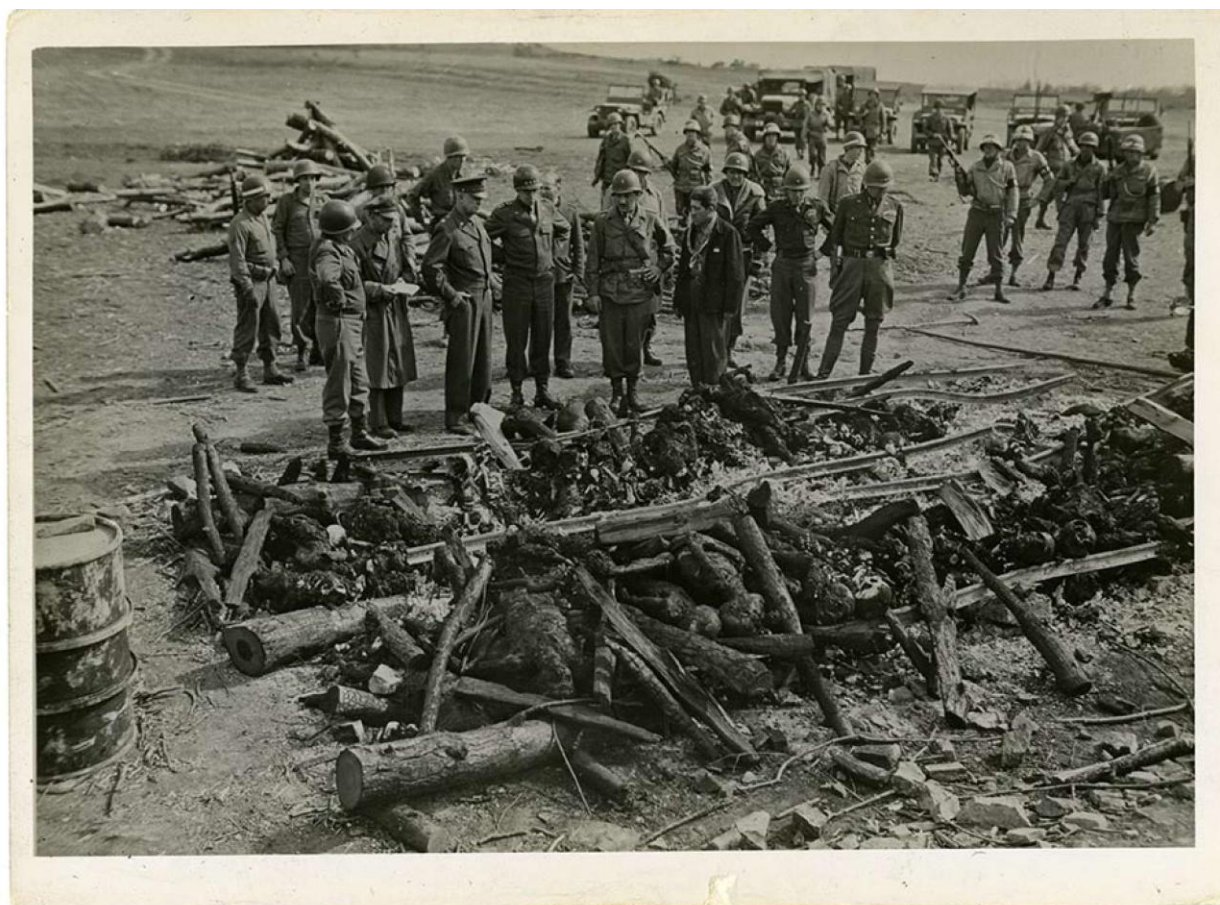
Generals Dwight D. Eisenhower, George S. Patton, and Omar Bradley view charred remains at Ohrdruf