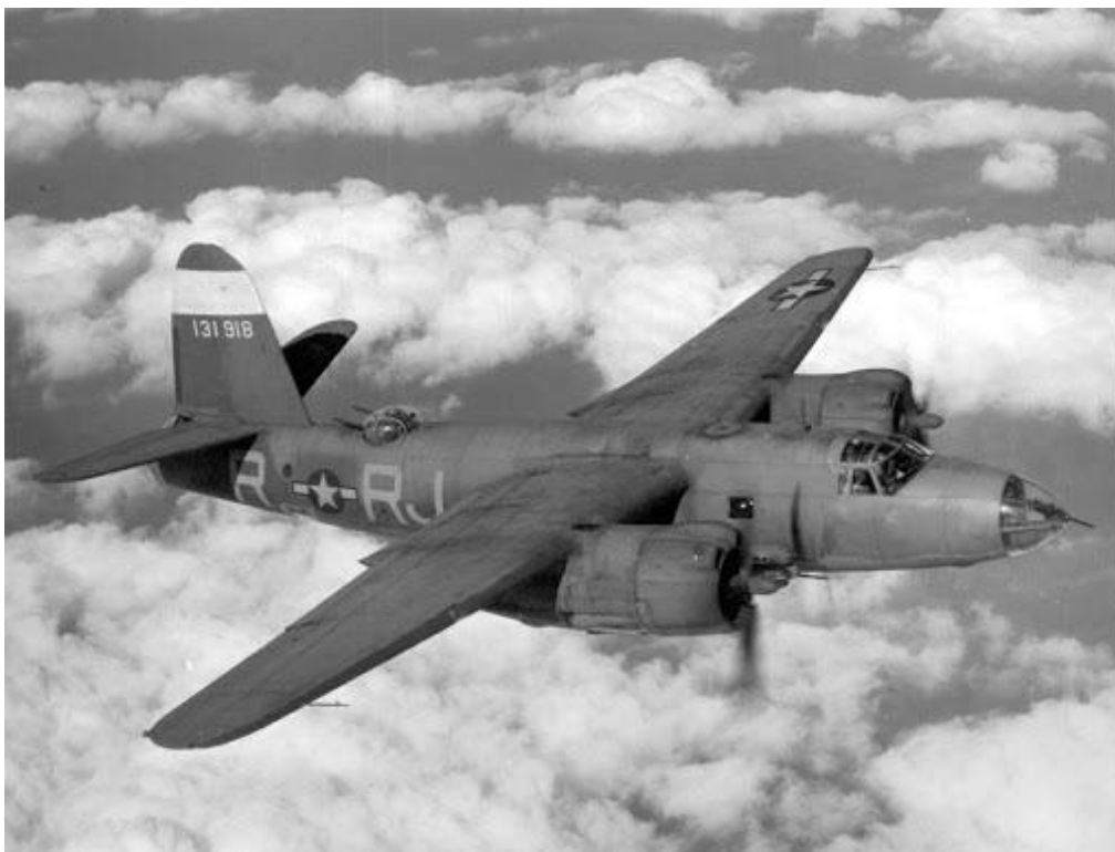
Martin B-26 Marauder bomber