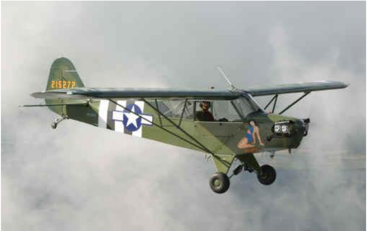
Piper L-4