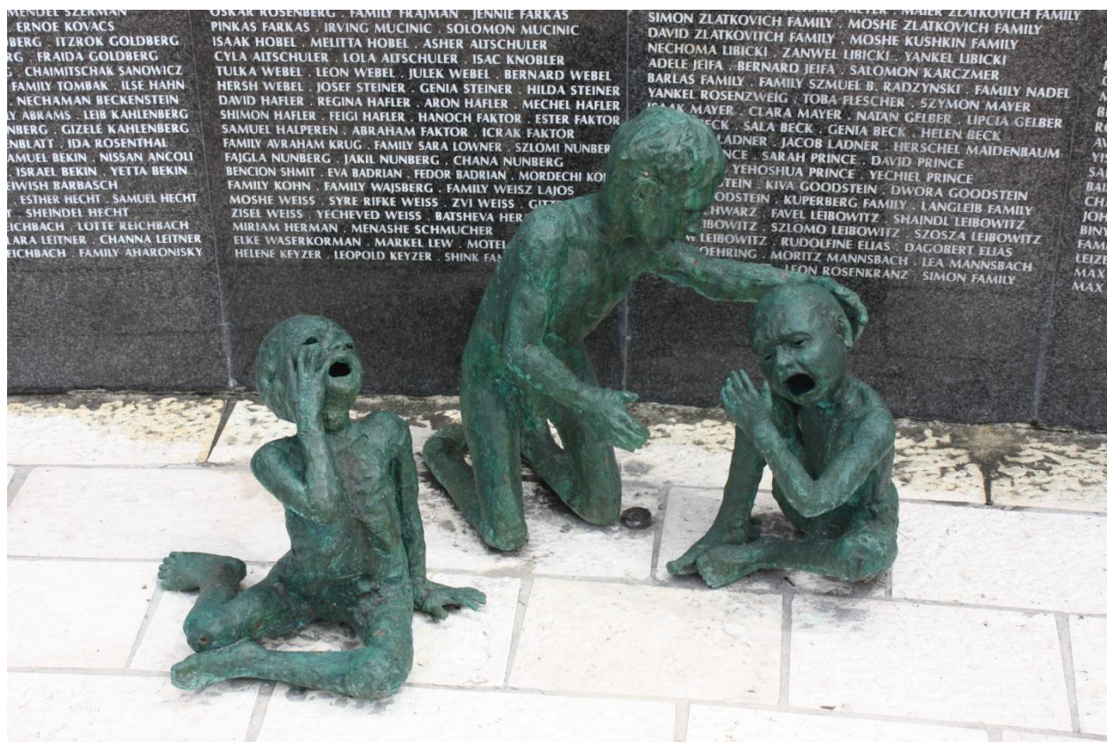
Holocaust Memorial, Miami, Florida

I recall one of my college history professors saying that his high school history teachers were World War II veterans, and "they showed us concentration camp films until we puked." They were just making sure the next generation would not forget what happened before them.