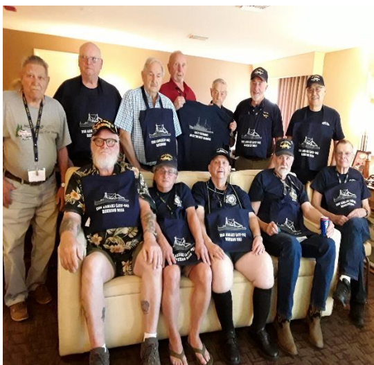
USS ABNAKI Crew