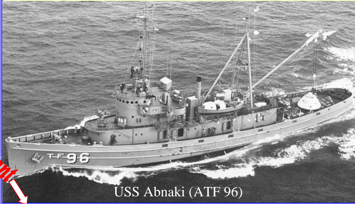
USS Abnaki (ATF 96)

"Life, Liberty and the Pursuit of Anyone Who Threatens It"