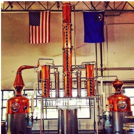
The Las Vegas Copper Angel

ONE NATION, UNDER GOD, WITH LIBERTY AND JUSTICE FOR ALL.