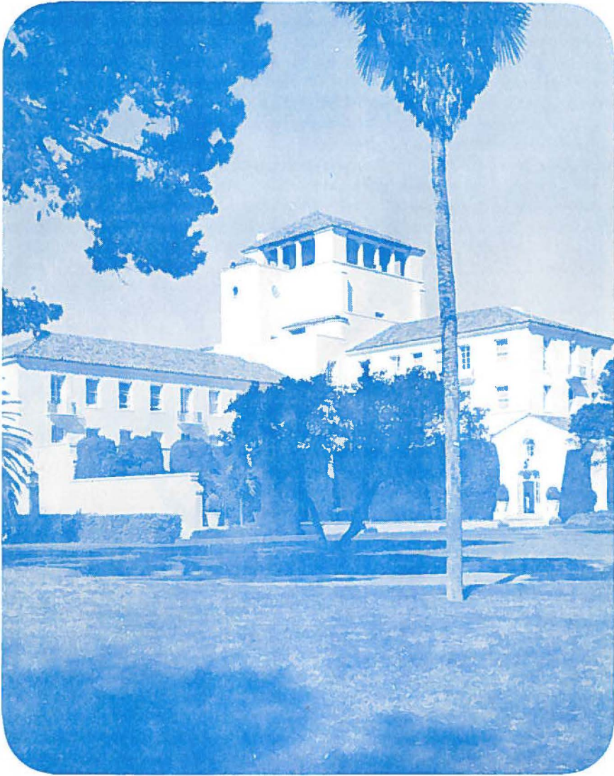
THE ADMINISTRATION BUILDING (FORMER OLD DEL MONTE HOTEL)