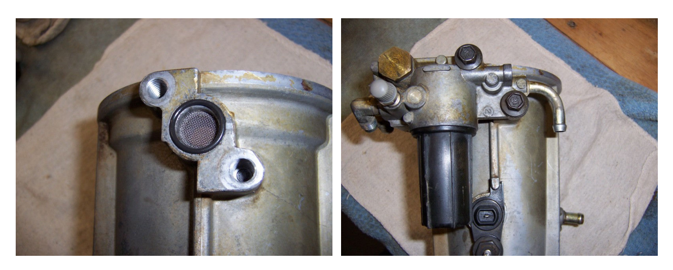
Mount the FPR to the Fuel Bowl:

Place the cleaned screen filter into the port opening on the fuel bowl and set the new O-ring #5 .into the recess.