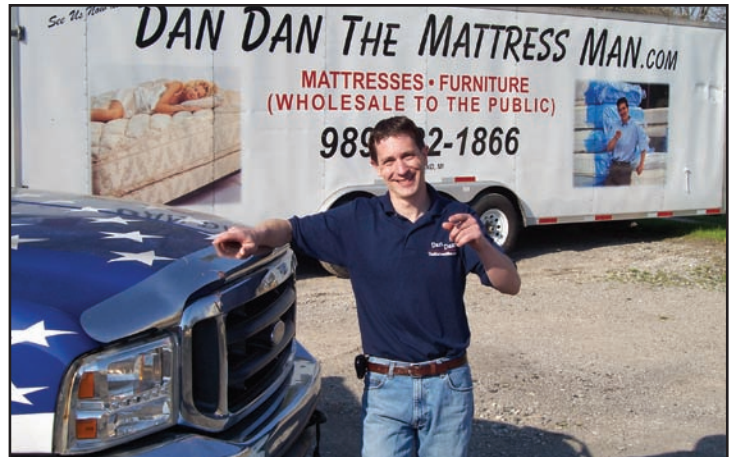
Dan Dan The Mattress Man

"Michigan Mega-Market is an incredible value for our clients. There are a lot of networks out there selling similar types of community papers in different areas across the country. We find that most do not have the quality placement into the papers' local classified section that the Community Papers of Michigan has worked so diligently to ensure in the Mega-Market program.