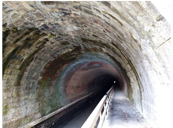
C&O Canal Paw Paw Tunnel