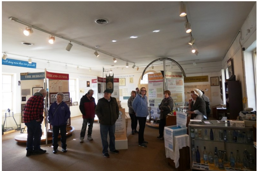
Museum of the Berkeley Springs