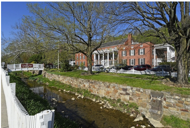
The Country Inn of Berkeley Springs