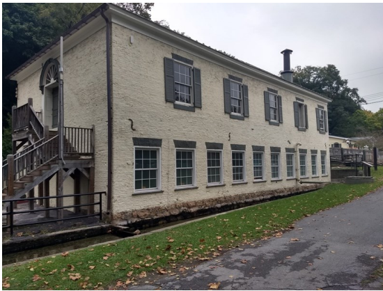
Roman Bath House at Berkeley Springs State Park