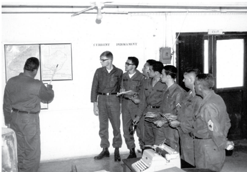
Soldiers from the US Army Reserve-Puerto Rico receive a briefing from one of their leaders, during the Cold War years. The 2012 marks the 90th anniversary of the US Army Reserve-Puerto Rico.

porting the operating force during the current conflicts.