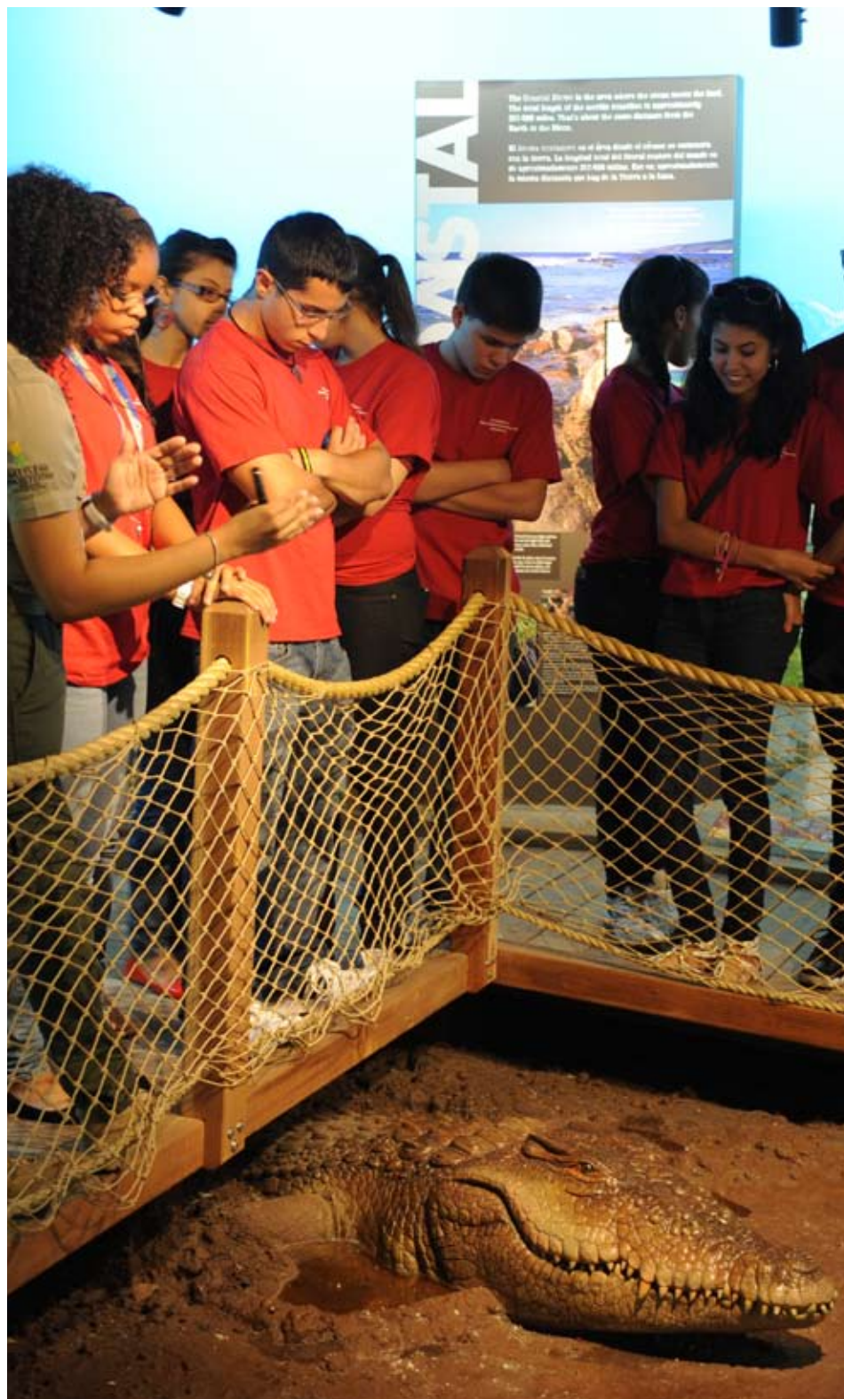
A guide from the San Juan Wildlife Museum explains to the YLEAD participants details about one of the displays. During the summit, the teenagers received free admission to the only museum of this type in the island, where they learned about ecosystems.