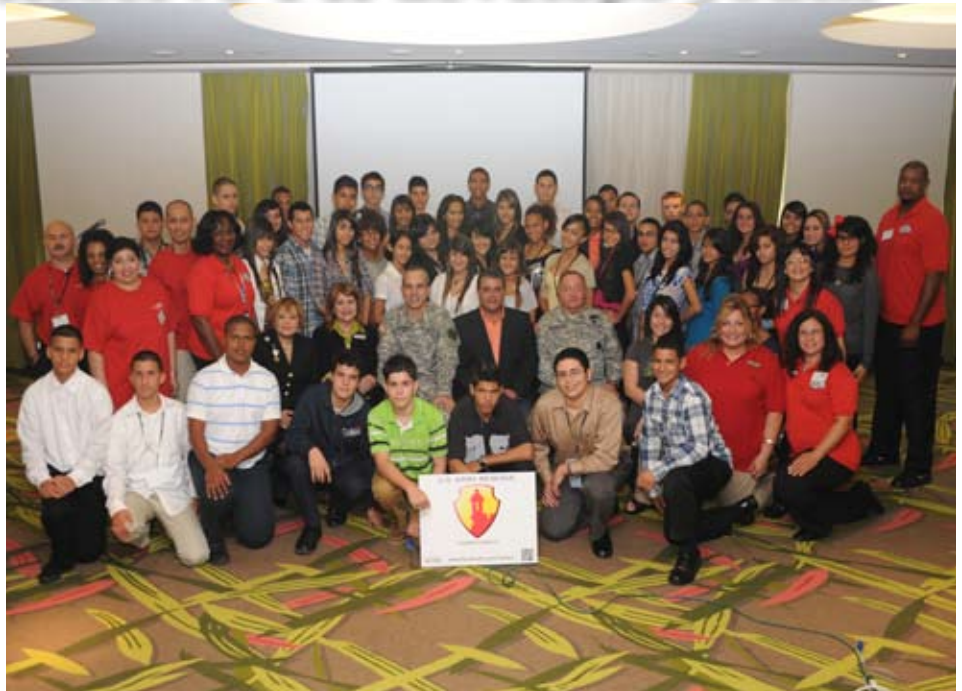
Approximately 50 teenagers, from several cities around the island of Puerto Rico, participated in the first Youth, Leadership, Education and Development (YLEAD) summit for reservists' dependents at the CONRAD hotel, 26-29 Jan 2012.

with the way the event was conducted for the first time in the Caribbean.