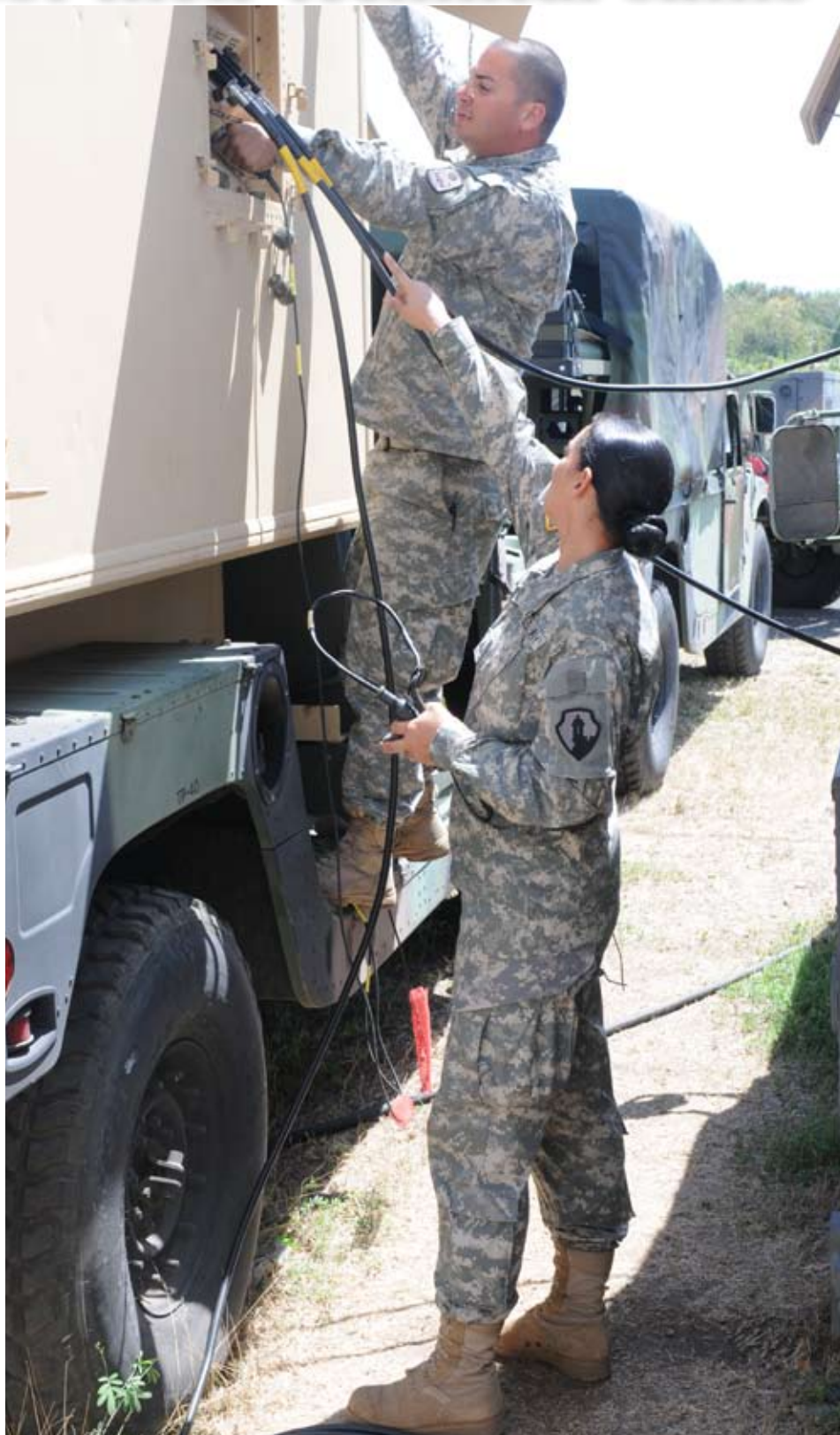
Soldiers troubleshoot a connection by replacing a coaxial cable in one of the communication shelters, at Camp Santiago Joint Maneuver Training Center, earlier during the year.