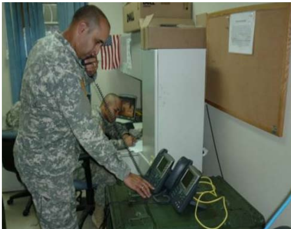
A soldier assigned to the 35th Expeditionary Signal Battalion configures a Voice Over Internet Protocol (VOIP) phone during the unit's communication exercise 2-3 Dec 2011.

"As in any exercise, there is always room for improvement. However, based on feedback received, we achieved the objectives for the training event," said Sanchez.