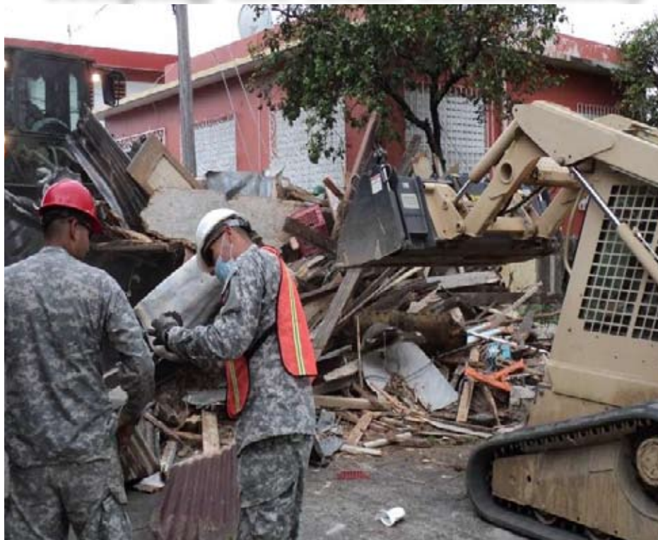
Troops assigned to the 475th Eng. Co. clean debris in the street of Guayama, as part of the unit's community outreach initiative, 21 Mar 2012.