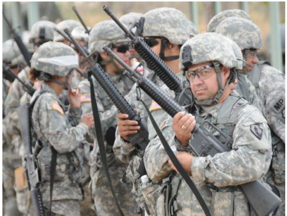
Soldiers assigned to the US Army Reserve-Puerto Rico get ready to qualify with their assigned weapon, during a recent weapons qualification exercise conducted at the Camp Santiago Joint Manuever Training Center. The support that employers provide to the reservists allow the command to conduct critical training events such as this one.

For more information visit the website www.esgr.mil