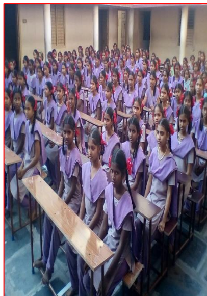
surrounding them. More about this program can be found here .

I am personally delighted to see well-dressed, disciplined girls focus deeply on their books, regardless of the conditions