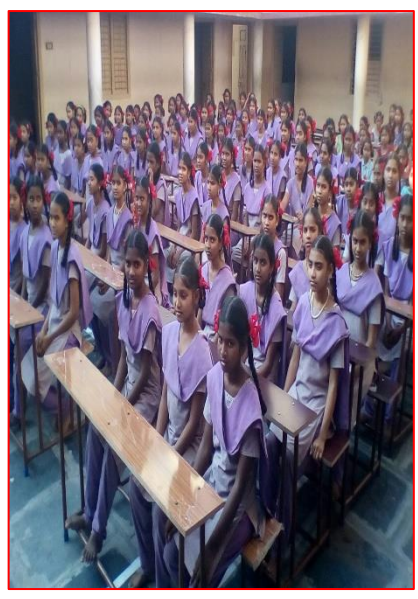
surrounding them. More about this program can be found here.

I am personally delighted to see well-dressed, disciplined girls focus deeply on their books, regardless of the conditions