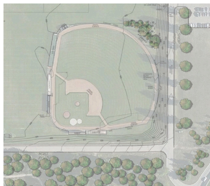
Current baseball field layout.