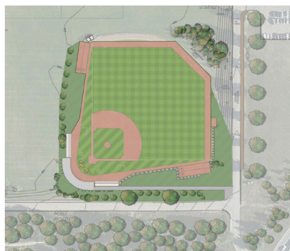
New baseball field layout.