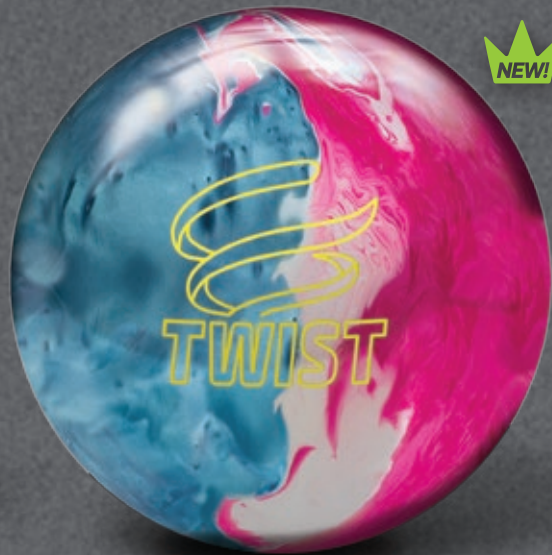
60-106064-93X Sky Blue/Pink/Snow