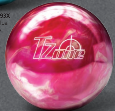
60-105300-93X Patriot Blaze 6, 8-16 lbs.