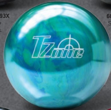
60-105746-93X Deep Space 6, 8-15 lbs.