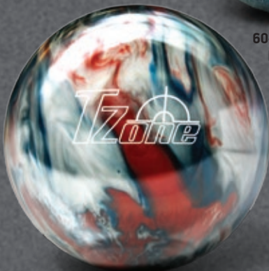
60-105354-93X Caribbean Blue 6, 8-16 lbs.