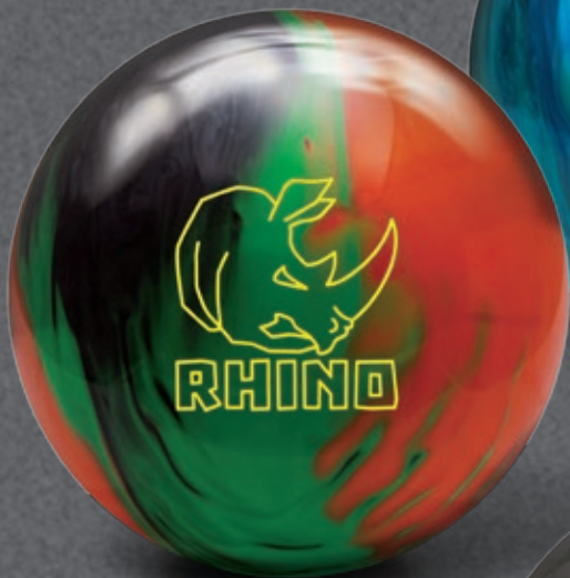
60-105910-93X Black / Green / Orange