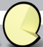
6, 8 lbs.