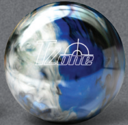
60-105302-93X Indigo Swirl 6, 8-16 lbs.