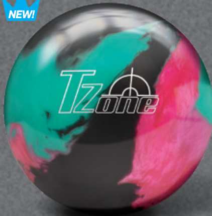
60-106165-93X Razzle Dazzle 6, 8-15 lbs.