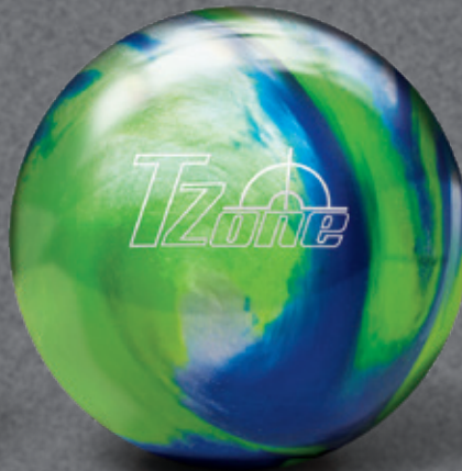
60-106043-93X Ocean Reef 6, 8-15 lbs.