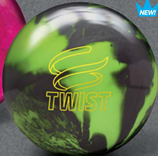
60-106163-93X Neon Green / Black