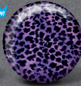
60-400616-93X Purple Cheetah