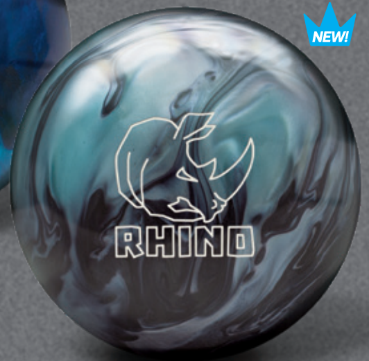
60-106164-93X Metallic Blue / Black