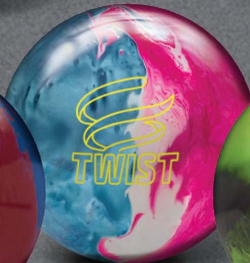
60-106064-93X Sky Blue / Pink / Snow