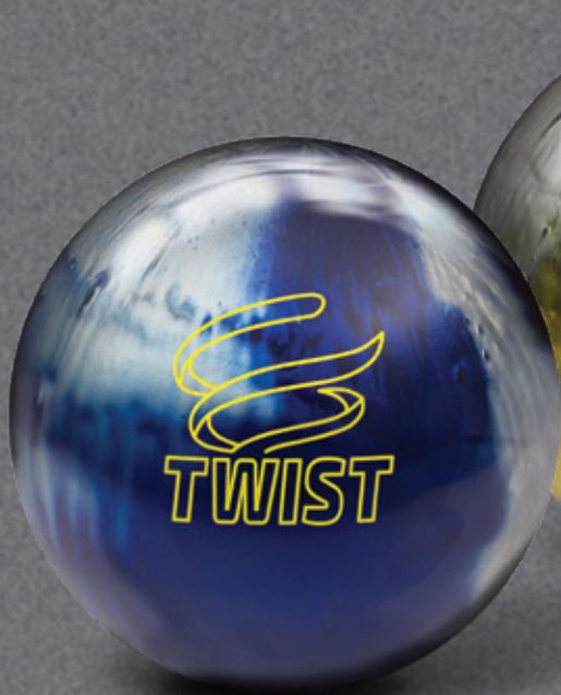
60-106063-93X Blue / Silver