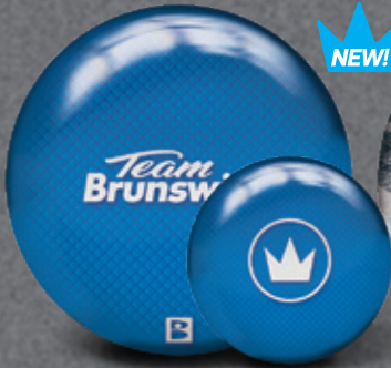
60-400620-93X Team Brunswick