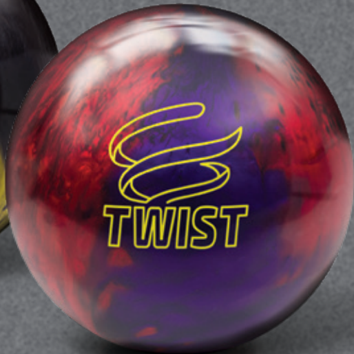
60-106061-93X Red / Purple