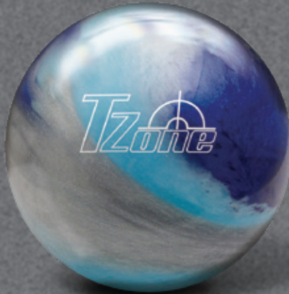
60-105911-93X Arctic Blast 6, 8-15 lbs.