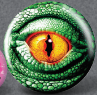
60-400528-93X Lizard Eye