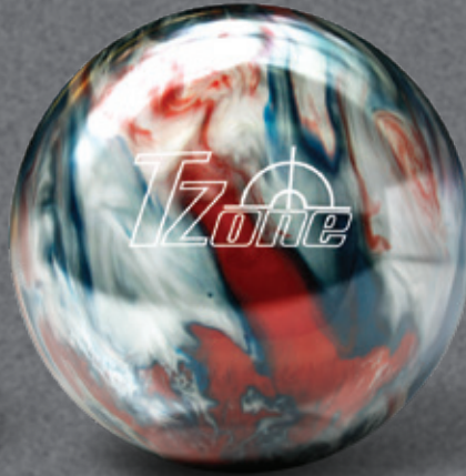
60-105300-93X Patriot Blaze 6, 8-16 lbs.