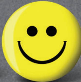
60-400245-93X Smiley Face