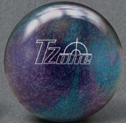
60-105746-93X Deep Space 6, 8-15 lbs.