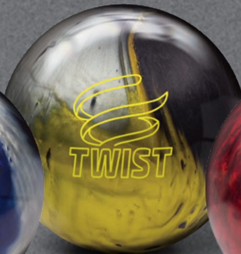
60-106062-93X Black / Gold / Silver