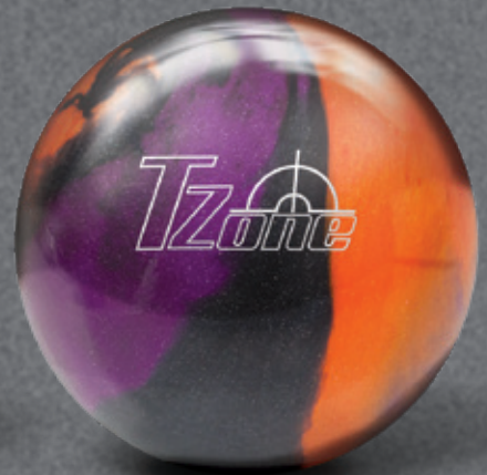
60-106044-93X Ultraviolet Sunrise 6, 8-15 lbs.