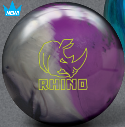
60-106162-93X Charcoal / Silver / Violet