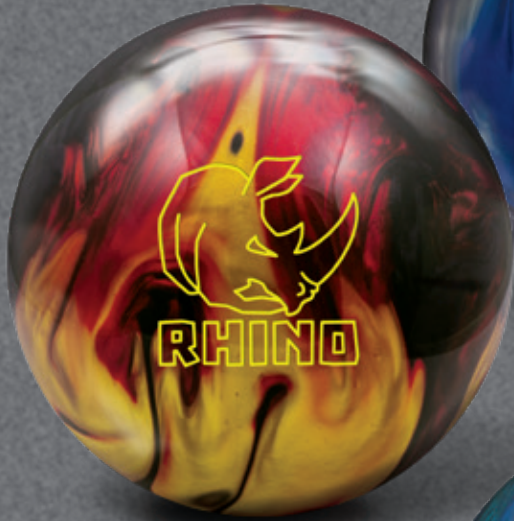
60-105813-93X Red / Black / Gold Pearl