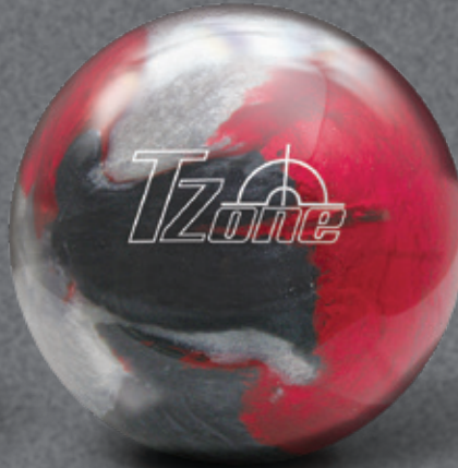
60-105912-93X Scarlet Shadow 6, 8-15 lbs.