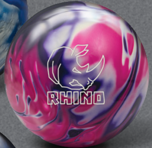
60-105811-93X Purple / Pink / White Pearl