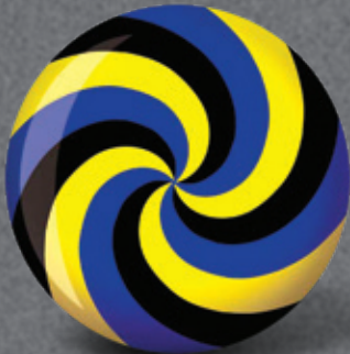
60-400575-93X Spiral Yellow/Blue/Black