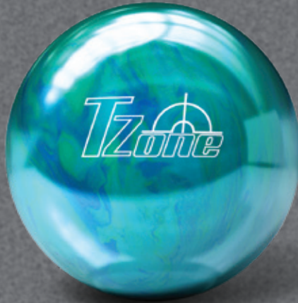
60-105354-93X Caribbean Blue 6, 8-16 lbs.