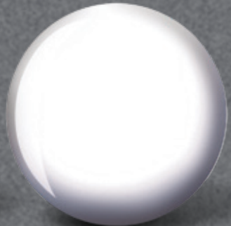
60-104221-93X White Ball