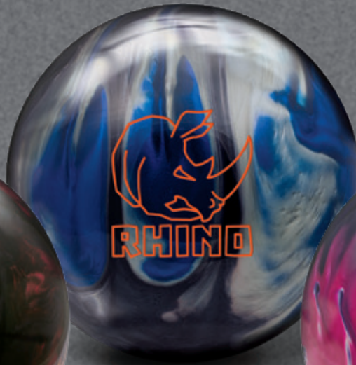
60-105815-93X Black / Blue / Silver Pearl