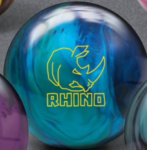
60-106037-93X Cobalt / Aqua / Teal Pearl