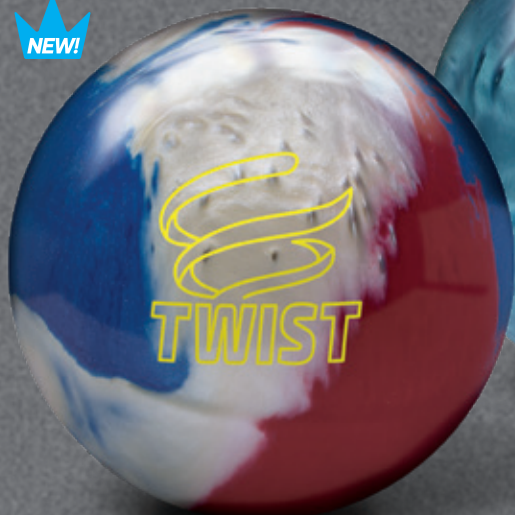
60-106161-93X Red / White / Blue