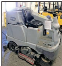
ADVANCE CONDOR ELECTRIC POWER SCRUBBER

ALSO: (200) ASSORTED TEAR DROP PALLET RACKS, CANTILEVER RACKING, DIE RACKS, STRETCH WRAPPERS, DIGITAL PLATFORM SCALES, DUMPING SCRAP HOPPERS, WORK BENCHES, TOOL CARTS, FLAMMABLE LIQUID STORAGE CABINETS, ROLLING SHOP LADDERS, RIGGING EQUIPMENT AND HARDWARE, RETRACTABLE HOSE REELS, RETRACTABLE ELECTRICAL REELS, LADDERS, ELECTRICAL/PLUMBING/MAINTENANCE HARDWARE, ELECTRIC HOISTS AND MORE