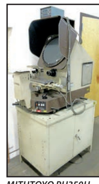
MITUTOYO PH350H OPTICAL COMPARATOR