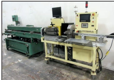
CINCINNATI MILACRON DOWNSTREAM EQUIPMENT