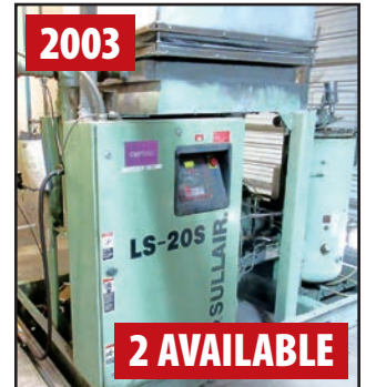
SULLAIR LS-20S 125 HP AIR COMPRESSOR