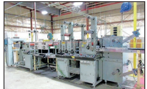
ALLIED GEAR NO 10 PRINTING PRESS