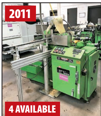
2011 GLEBAR PG-9CRG CNC OD GRINDING SYSTEM