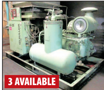
SULLAIR LS-25 200 HP AIR COMPRESSOR