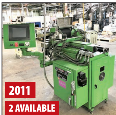
2011 GLEBAR TF-9BHD CNC THROUGH FEED GRINDER