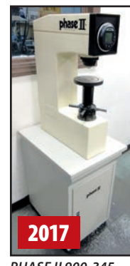
2017 PHASE II 900-345 DIGITAL ROCKWELL HARDNESS TESTER