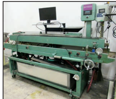
RON COOLING TROUGH