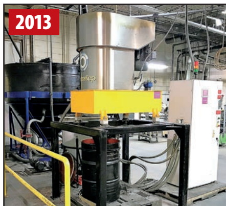
2013 CENTRA SEP 10 HP CHIP RINGER/COOLANT FILTER RECOVERY UNIT