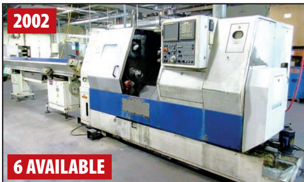
2002 DAEWOO PUMA 230MSA TURNING CENTER

(6) 2002 AND 2000 DAEWOO PUMA 230MSA TURNING CENTERS, s/n 23MS2544, 23MS2541, 23MS0220, 23MS0217, 23MS0153, 23MS0123, w/Fanuc 18i-T Control, (2) w/Lemca Boss 542 CNC/37 Bar Feed (sold separately)