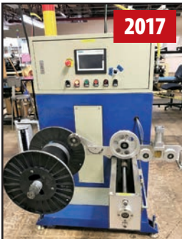
CGM 24" HI-SPEED SPOOLER