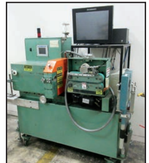
2" X 16" CATERPULLER/ CUT-OFF

View our current auction schedule at www.perfectionindustrial.com