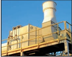
PLATING LINE SCRUBBER SYSTEM

Inspection: Monday, March 4 from 8:00 AM to 4:00 PM ET