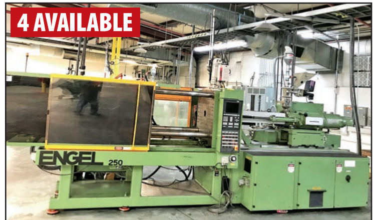
ENGEL 250-TON INJECTION MOLDER

To discuss your requirements for an auction, please call Perfection Industrial +1-847-545-6374