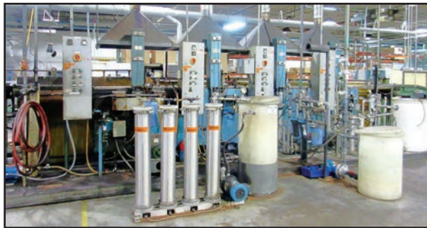
CUSTOM PARTS WASH LINE