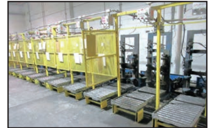
CUSTOM 15 DRUM TUMBLER/MIXER