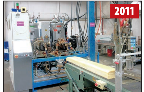
CUSTOM DENSE FOAM EXTRUSION SYSTEM