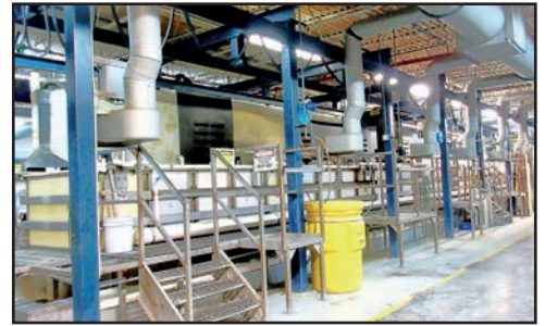
NICKEL AND BLACK OXIDE PLATING LINE