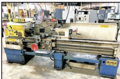
LION 24" X 96" GAP BED ENGINE LATHE