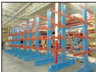
VIEW OF CANTILEVER RACKING