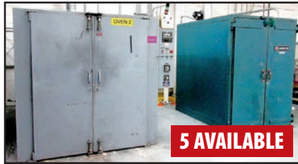
VIEW OF OVENS

ALSO: 2016 PRO ULTRASONIC PRO3624 ULTRA SONIC WASH SYSTEM, s/n 362400391, W/GANTRY HOIST SYSTEM, PRI ACETONE DISTILLING SYSTEM, FINISH THOMPSON LS-55IID SOLVENT RECYCLING SYSTEM, (4) JSCC AUTOMATION TONER AUTO-FILLING UNITS, (5) TEK TEMP TKD200 CHILLERS, HAYSSEN BARREL MIXER, COWLES DISSOLVER MIXER, CUSTOM 15 DRUM TUMBLER MIXER, (8) BLUE-M STABIL-THERM OVENS, CYCLONE STAINLESS STEEL PARTS BLOWER/FILTER TUNNEL, (42) ASSORTED PNEUMATIC PUMPS, (56) PNEUMATIC MIXERS/AGITATORS, RAM BARREL CRUSHER, PAINT SHAKERS