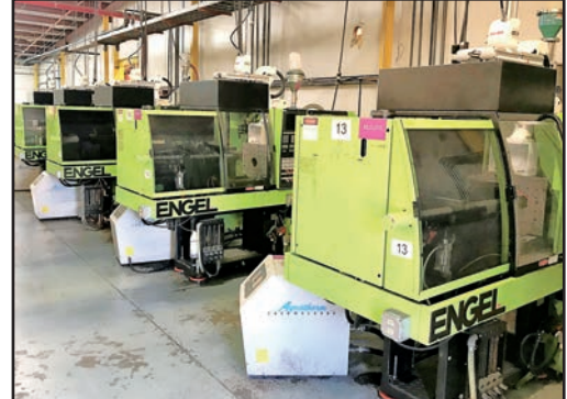
ENGEL 30- AND 28-TON INJECTION MOLDERS