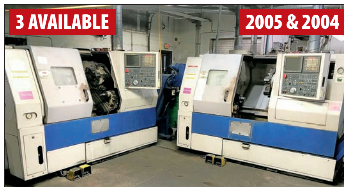
DAEWOO PUMA 240A TURNING CENTERS