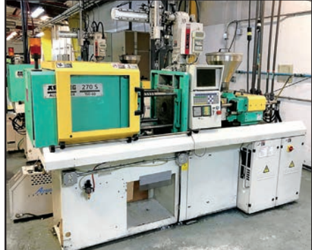
ARBURG 15-TON INJECTION MOLDERS