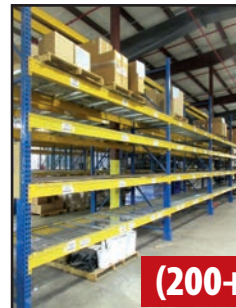
VIEW OF ADJUSTABLE PALLET RACKING