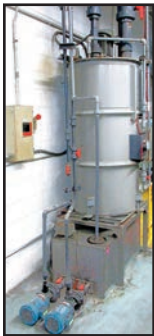
PLATING LINE SCRUBBER SYSTEM