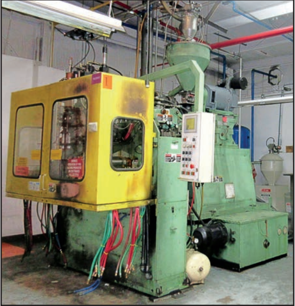
BEKUM H121-S831 SINGLE EXTRUSION DOUBLE DIE BLOW MOLDER