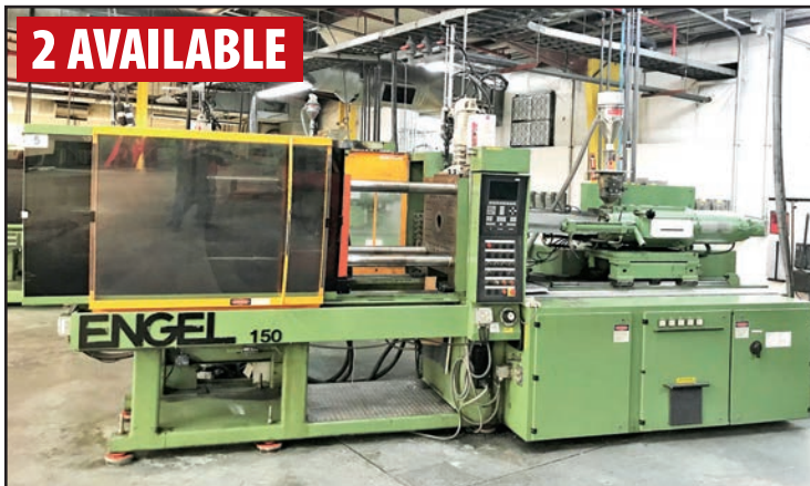
ENGEL 150-TON INJECTION MOLDER

View our current auction schedule at www.perfectionindustrial.com