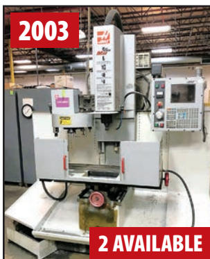
2003 HAAS TM-1 VERTICAL MACHINING CENTER