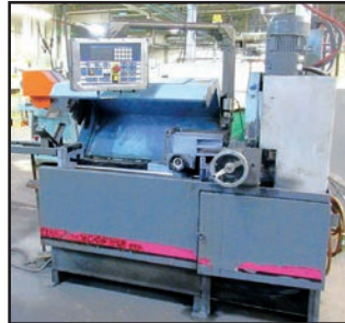
TIGER SAW 350FE CNC AUTO COLD SAW