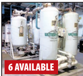
ULTRA-AIR REGENERATIVE AIR DRYERS