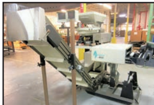
ADVANCED AUTO BAGGING/PRINTING/PACKAGING SYSTEM

(2) 2016 MIYACHI UNITEK LW50A LASER WELDERS , w/Tek Temp Chiller