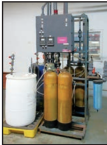
DI WATER SYSTEM