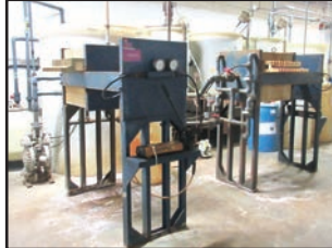
WASTE WATER TREATMENT PLANT