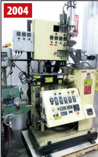
DAVIS STANDARD 1" 24:1 EXTRUDER LINE

Webcast Bidding Available Through BidSpotter.com