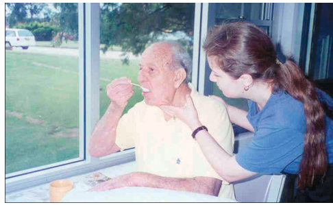
Careful assessment of swallowing can prevent aspiration, a common complication after stroke.

Many issues need to be addressed in rehabilitation programs, whatever the environment. Rehabilitation will only be successful if the team, patient and carers cooperate to set interdisciplinary goals. Regular team and family meetings are thus mandatory. Cohesion is often aided by the appoint-