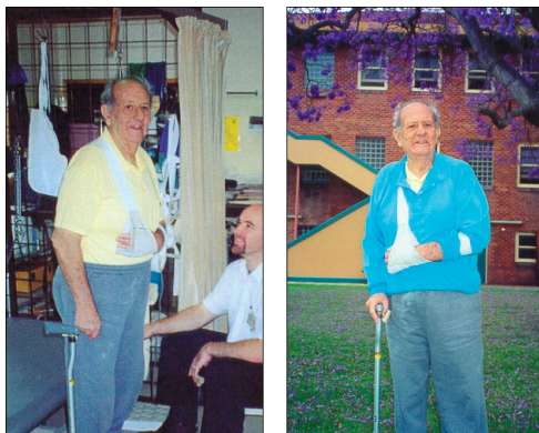
Safe ambulation is checked in the indoor and outdoor environments.

ment of a “key person”, one member of the team who liaises with the family; this is also often less intimidating to family members.