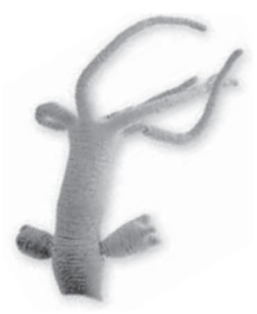
Like most animals, bears produce offspring by sexual reproduction. However, some animals, such as hydra, can reproduce asexually.