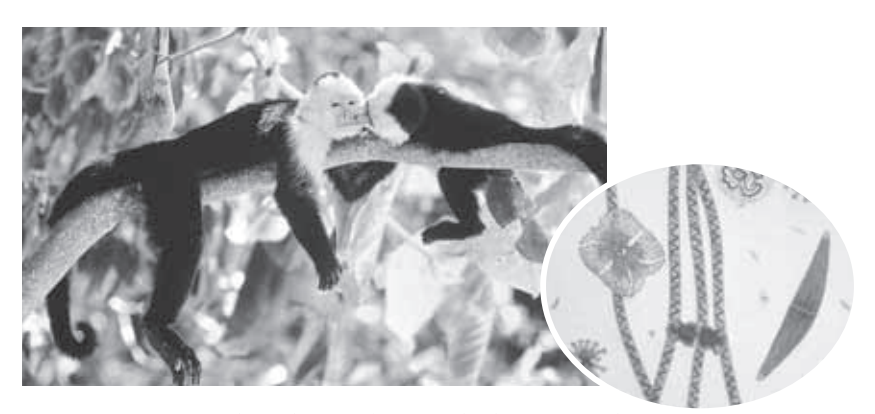
Some organisms, such as the monkeys on the left, are made up of trillions of cells. The protists on the right are made up of one or a few cells. They are so small they can only be seen with a microscope.

Some organisms are made of trillions of cells. In these organisms, different kinds of cells do different jobs. For example, muscle cells are used for movement. Other organisms are made of only one cell. In these organisms, different parts of the cell have different jobs.