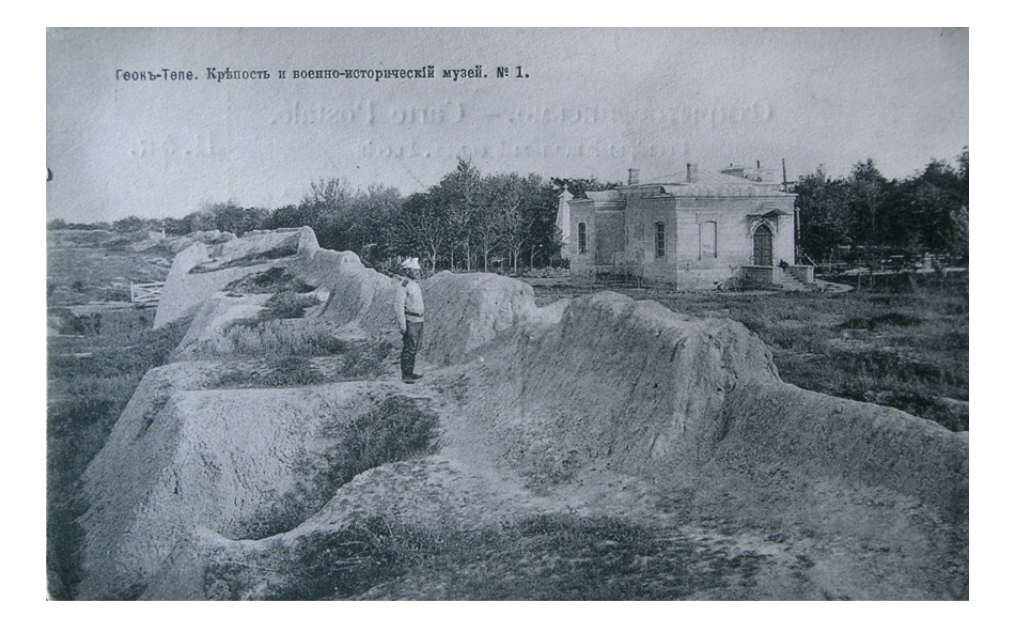
FIG. 3. Geok-tepe. Fortress and the historical war museum.

resumed after the annexation in 1885 of the Merv oasis, which surrendered without resistance, much to the dismay of the British. On the Amu Darya, a wooden bridge was built, which was specially designed to be flexible enough to withstand the river in flood.