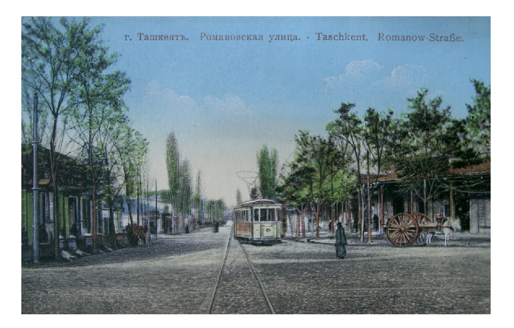
FIG. 5. Tashkent. Tramway on Romanov Street.