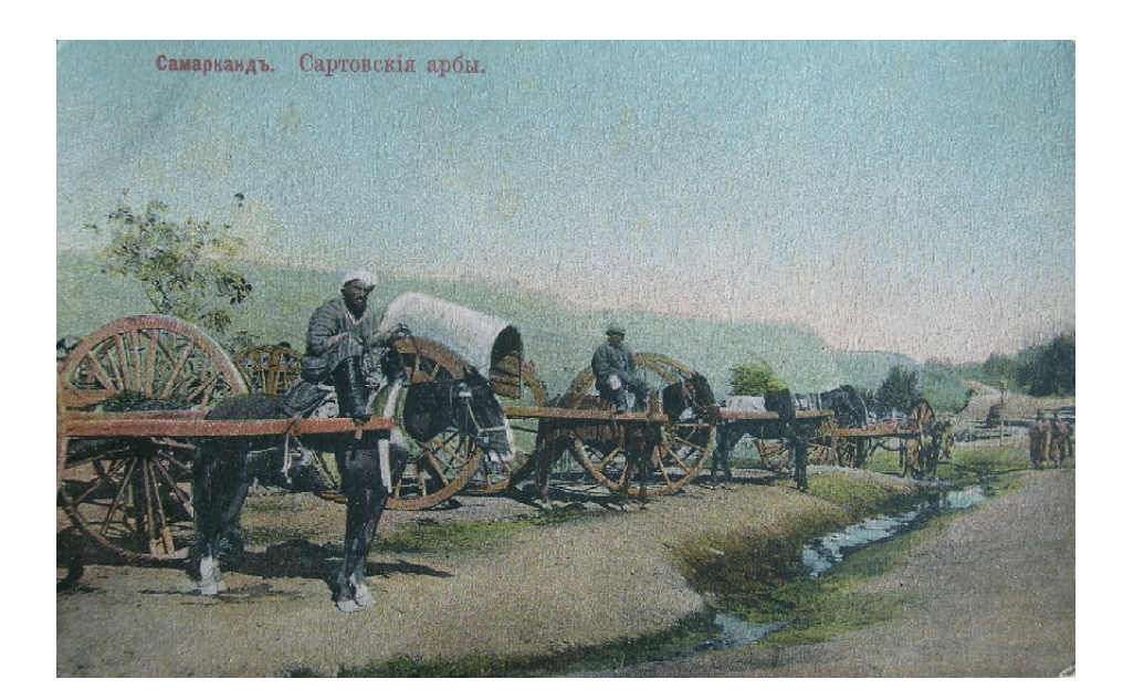
FIG. 4. Samarkand. Carriages (arbas) of the Sarts.

Initially, there were only as many passengers as there were carriages. Annenkov then did some 'advertising' for his train, vaunting the merits of cheap, fast transport for pilgrims who wanted to visit the holy places. It was a great success and the pilgrims were carried in special carriages. Some occupations associated with the caravan trade (muleteers, guides, etc.) inevitably disappeared. Train prices were extremely competitive (Figs. 4 and 5). In 1876 to go from Tashkent to Bukhara took 26 days by camel: the train did the same journey in a quarter of the time at three-quarters of the price.