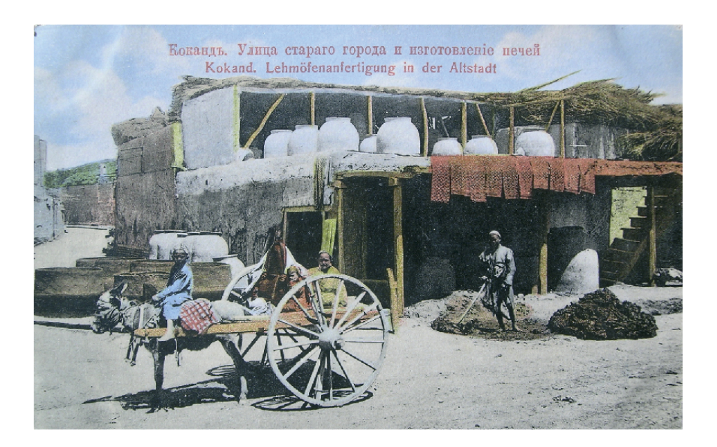
FIG. 6. Kokand. Pot-maker in the old town.

' shaytan arba '(Devli's carriage), buying a Russian stove or using Russian bricks to build a home, etc. Many occupations suffered or even disappeared to the benefit of Russian producers, for example pot-making, shoemaking, domestic utensil-making, etc. (Fig. 6). The numerous advertisements for Russian banks in Central Asia, Singer sewing machines and French perfumes found in contemporary publications (such as in Dmitriev-Mamonov's book), <sup>37</sup> the many pictures of colonial Turkistan published in recent books<sup>38</sup> and the large areas of colonial architecture still found in Samarkand and Termez today, as well as in many other cities of the five independent republics, are contrasted with the credo of the Jadids, who wanted to awake their dormant society. These two trends coexisted in Central Asia until the end of the tsarist period.