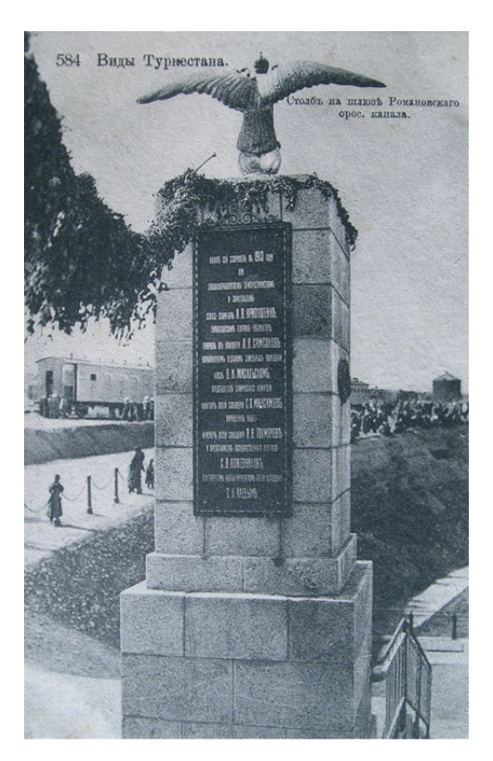
FIG. 2. Turkistan. Monument (dated 1913) on the bank of the Romanov canal. A railway is seen behind.