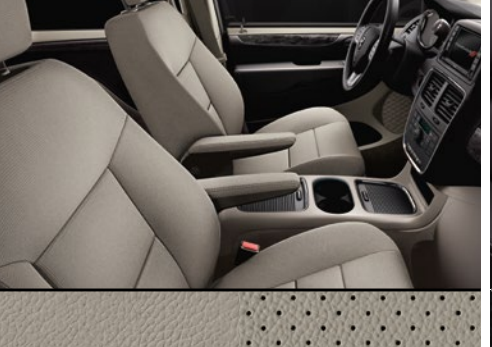
//// Cloth in Light Greystone — Standard on Crew //// Leather-faced with perforated inserts in Light Greystone — Standard on Crew Plus