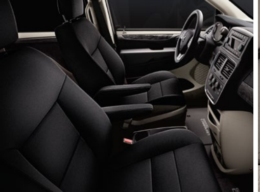
//// Cloth in Black — Standard on CVP, SXT and Crew