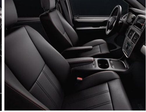
//// Leather-faced with perforated inserts in Black with