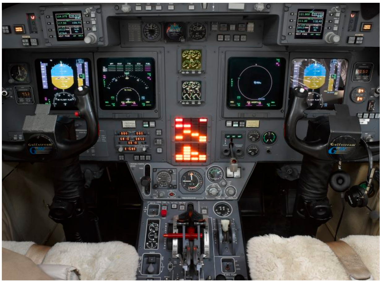
Specifications subject to verification upon inspection. Aircraft subject to prior sale.

GLOBAL HEADQUARTERS 5525 N.W. 15<sup>th</sup> Avenue, Suite 301B · Fort Lauderdale, Florida 33309 +1 (954) 703-1600 · www.eastcoastjetcenter.com