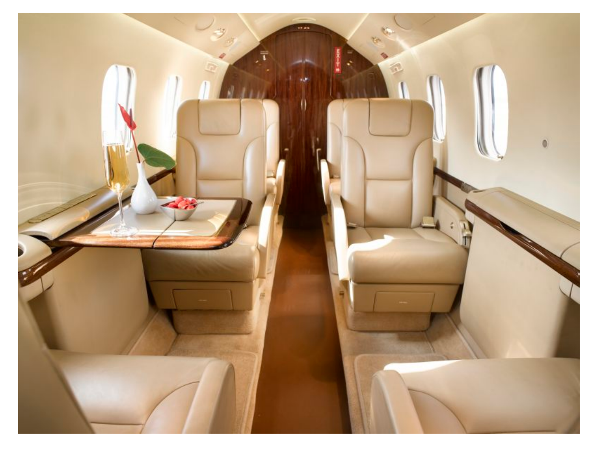
Specifications subject to verification upon inspection. Aircraft subject to prior sale.

Universal Univision Airshow Individual headset jacks / controls at each passenger seat Cabin speaker system with sub-woofer MSA manual shades Lighting controls at cabin entrance, each individual seat and main control console at master seat location Warming Oven Dual hot liquid dispensers Dual cup dispensers Three ice drawers Trash container Lav vanity mirrors with hidden storage Externally serviceable fully enclosed AFT lavatorv Miscellaneous storage Removable matching vinyl runner for cabin entrance and center isle